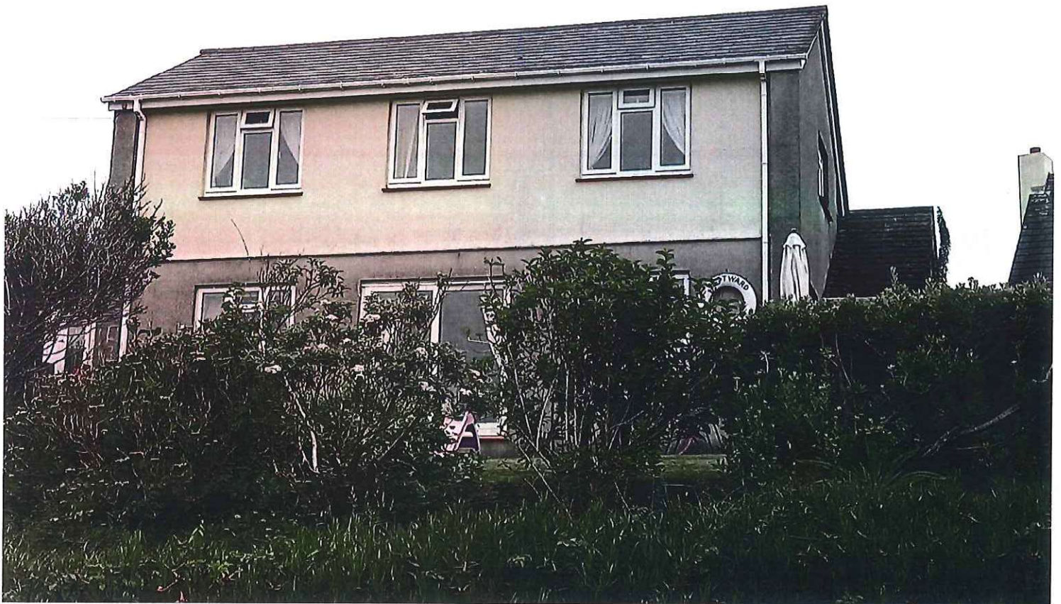
Photo 1. West elevation

The proposed planning application concerns works to the fabric and structure of the existing single-storey residential components only. The application outlines the installation of 2 new dormer windows above the existing north and south double-glazed fenestration and a central velux window on the roof of the western aspect (see Photo 1. of western aspect).