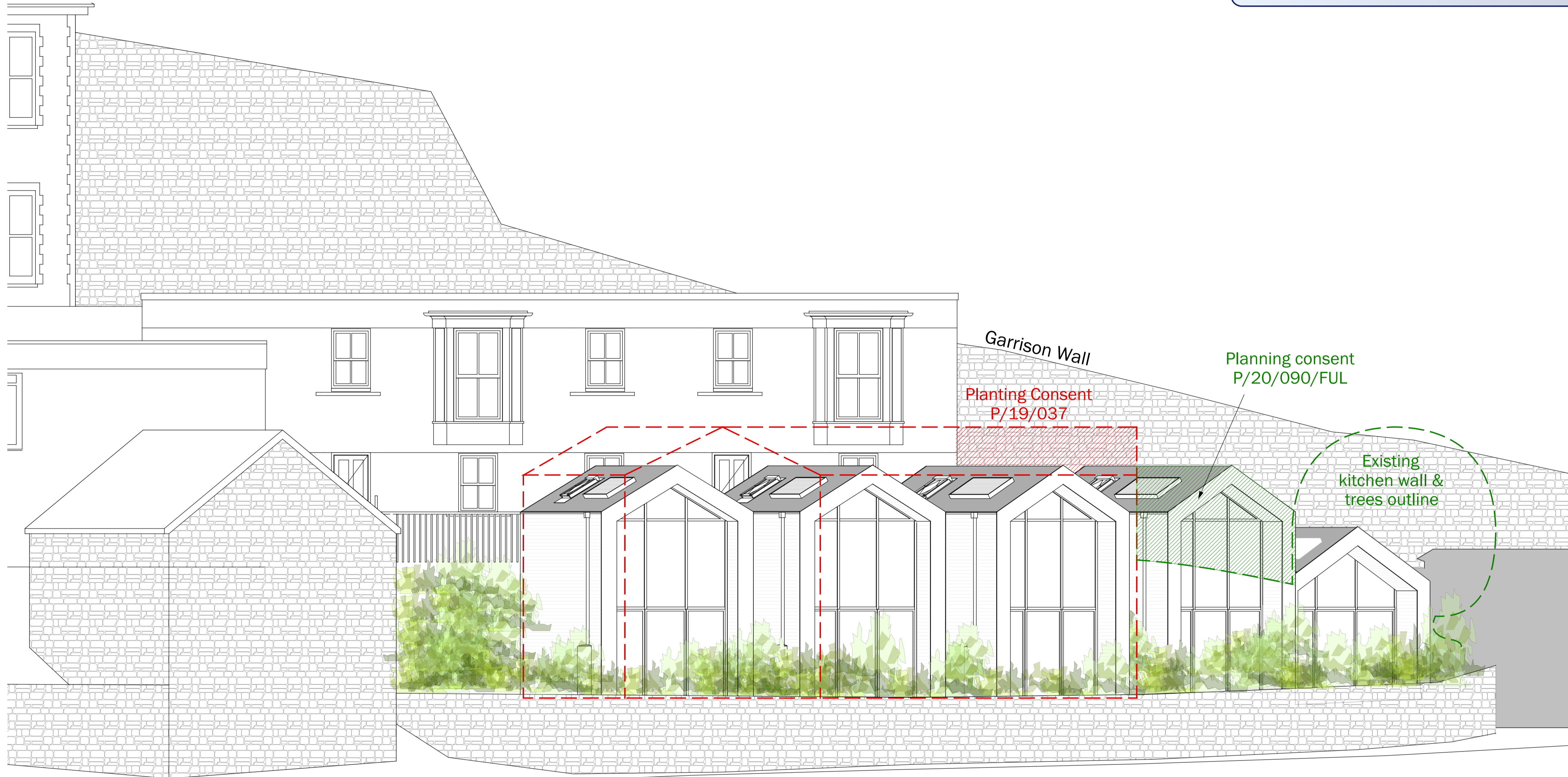
SKETCH SHOWING IMPACT ON GARRISON WALL 1:50

Information supplied by others. All measurements subject to full onsite investigation prior to construction.