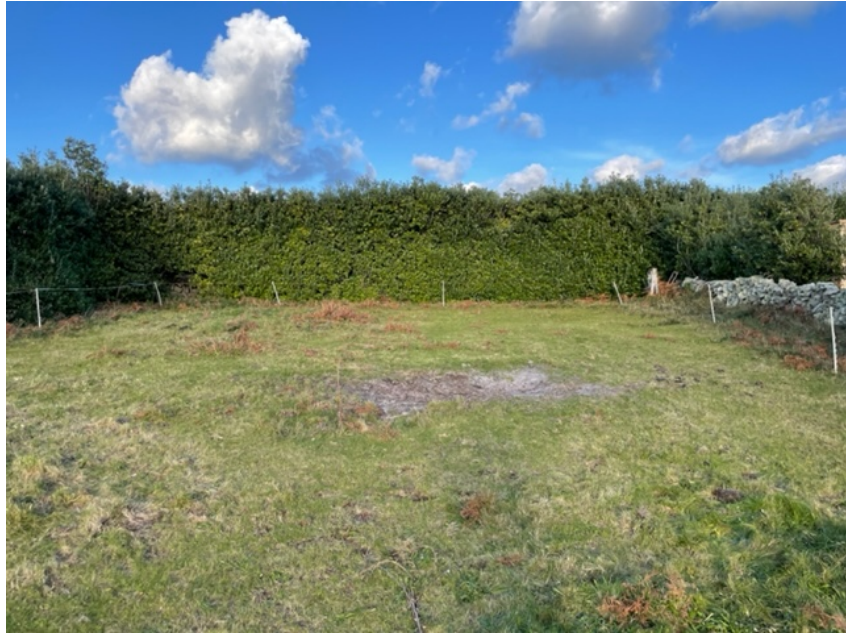
View from the site towards boundary with road