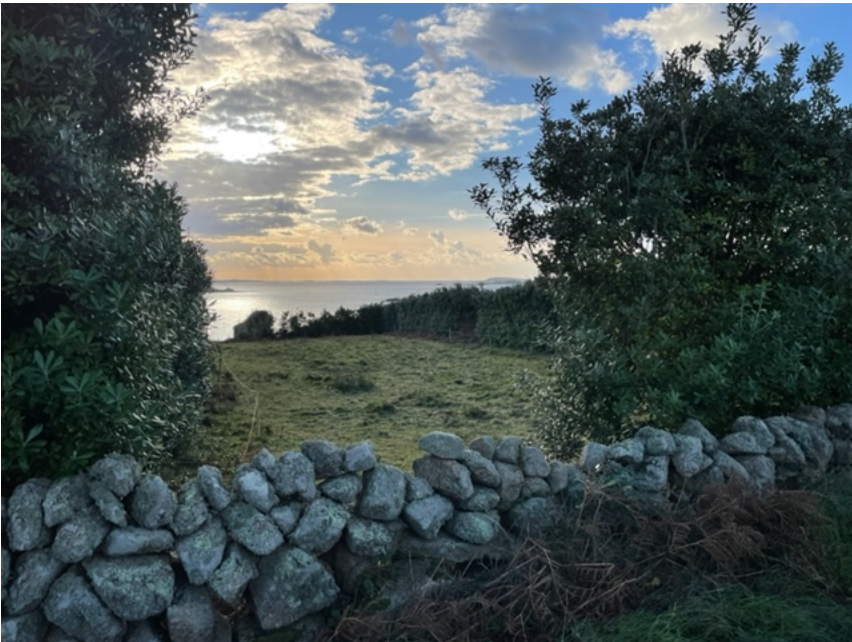
View from road