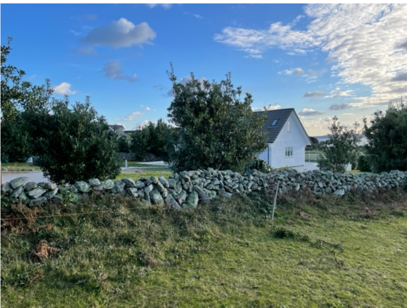
View along eastern boundary to Trethagan

RECEIVED By A King at 8:46 am, Jan 26, 2023