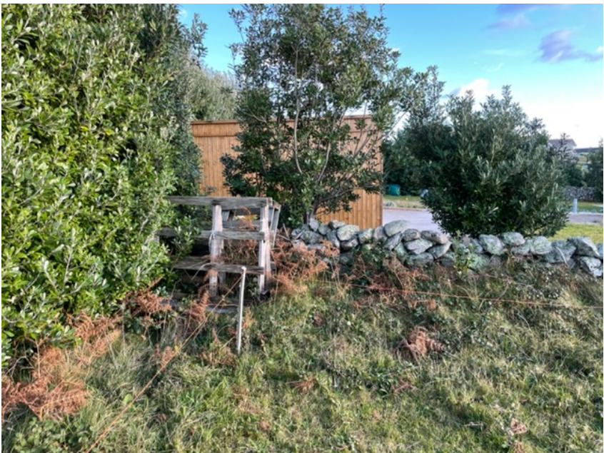
View along eastern boundary to existing small shop