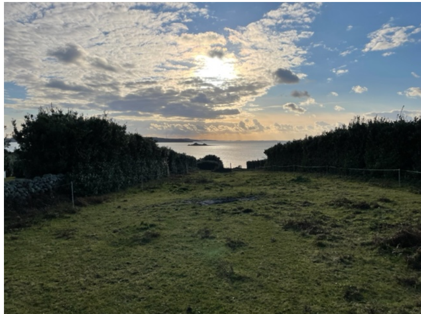
View from the site towards the sea view