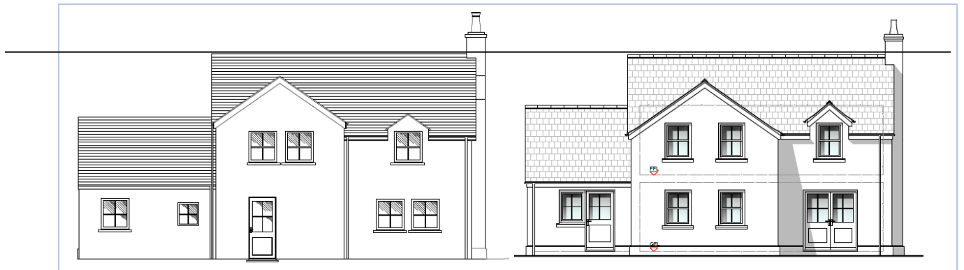
Figure 3 Rear Elevation as Approved (left) and as amended (right)