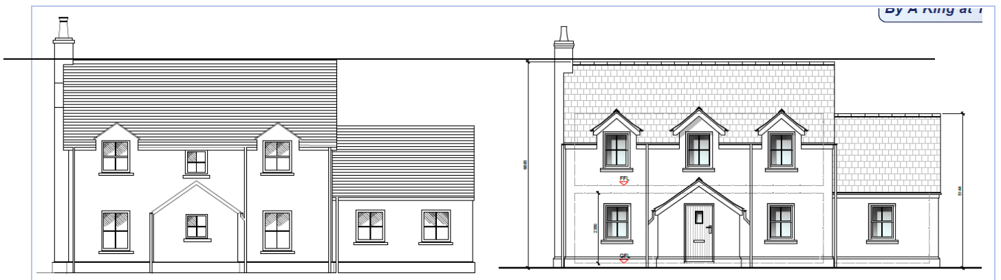
Figure 1 Approved front elevation (left) and amended front elevation (right)