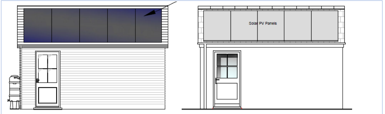
Figure 5 South Elevation of the garage as approved (left) and as amended (right)