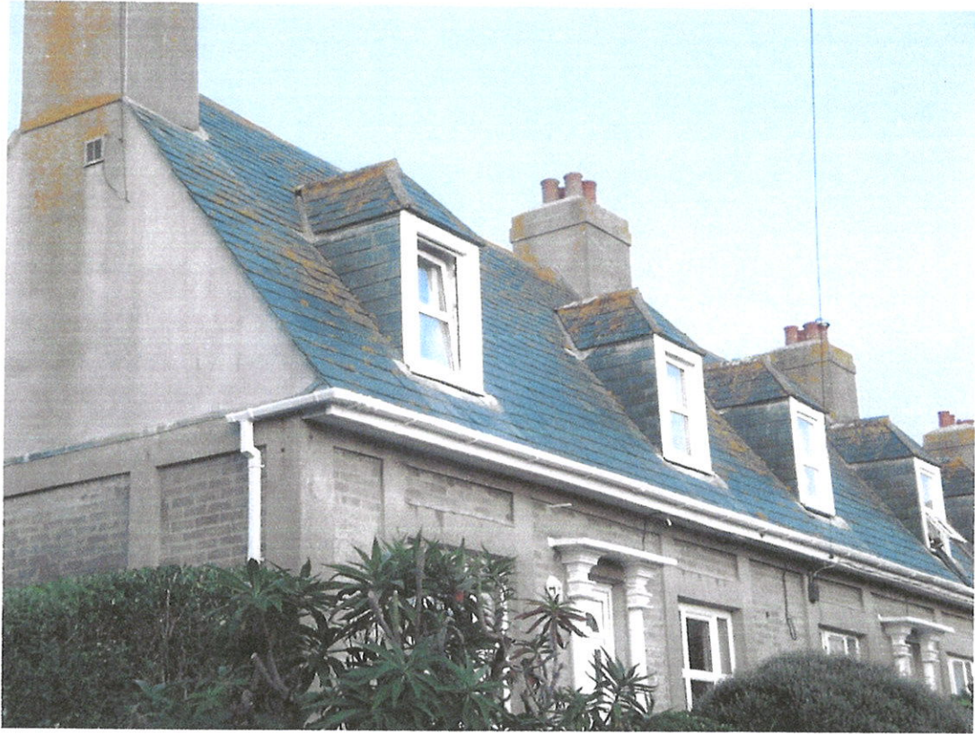
Photo of existing front slope roof of Porthcressa Terrace, with dry laid slate

Re. Planning Application: 1 and 2 Porthcressa Terrace, St Mary's, Isles of Scilly TR21 0JW To: Replace the existing wet-laid scantle rear roof slope with dry-laid natural slate