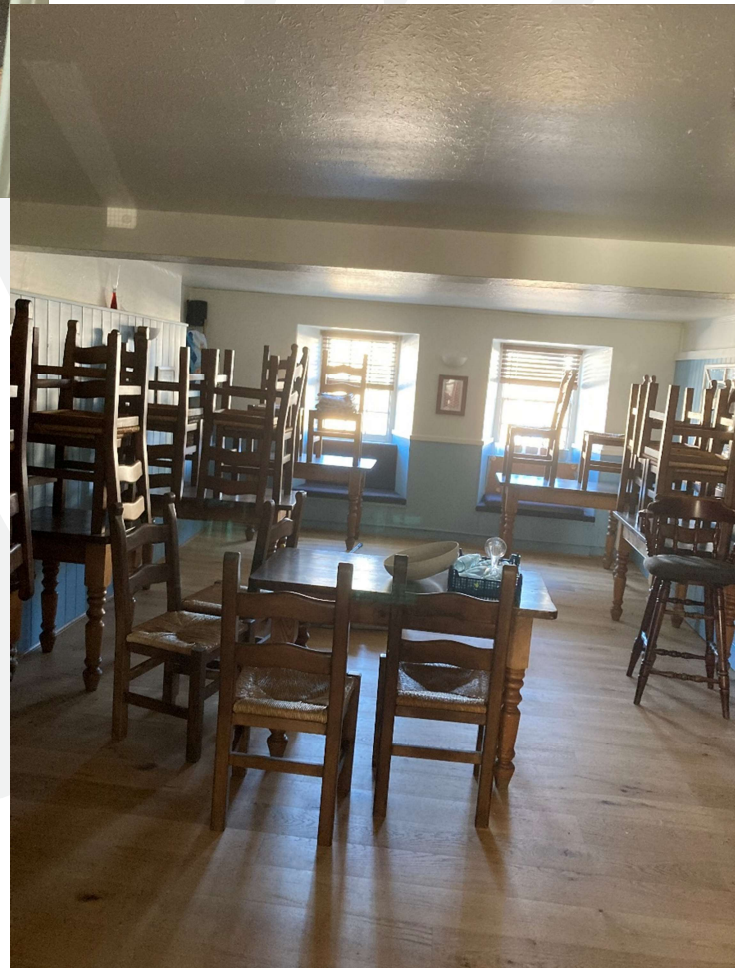
Image of secondary bar area at first floor in original part of the building prior to works