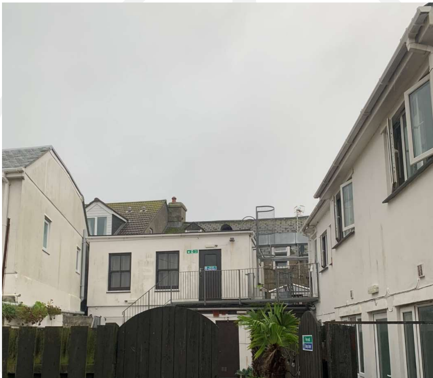
Rear Elevation showing extensions