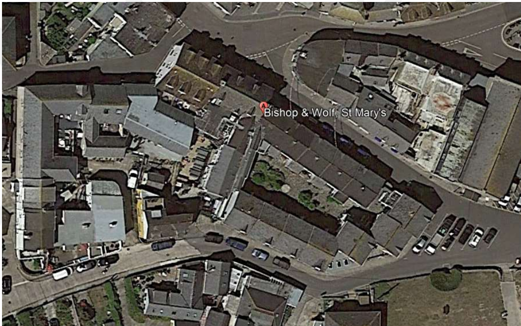
Google Earth Image