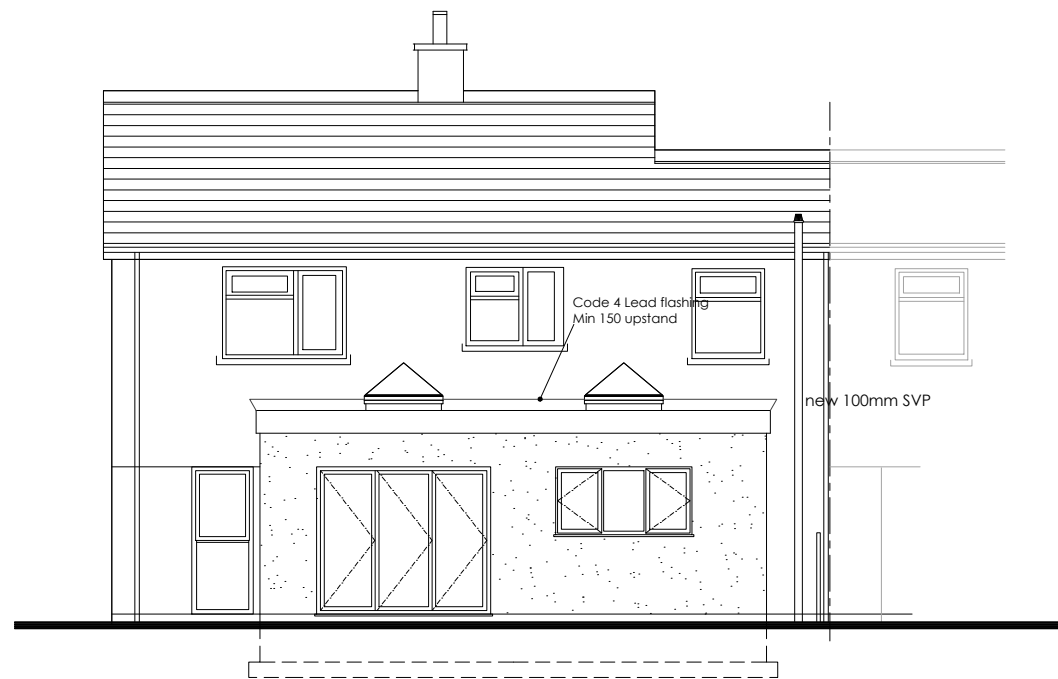
REAR (NORTH) ELEVATION