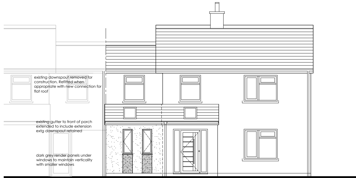
FRONT (SOUTH) ELEVATION

1. GENERAL All materials and workmanship to comply with the recommendations and requirements of all current relevant British Standard Specifications and Codes of Practice, Building Regulations. All proprietary products to be utilised fully in accordance with the manufacturers instructions. All structural timber to be GS or SC3 grade preservative treated. The Contractor shall take into account everything necessary for the proper execution of the works, to the satisfaction of the "Inspector" whether or not included on the drawings.