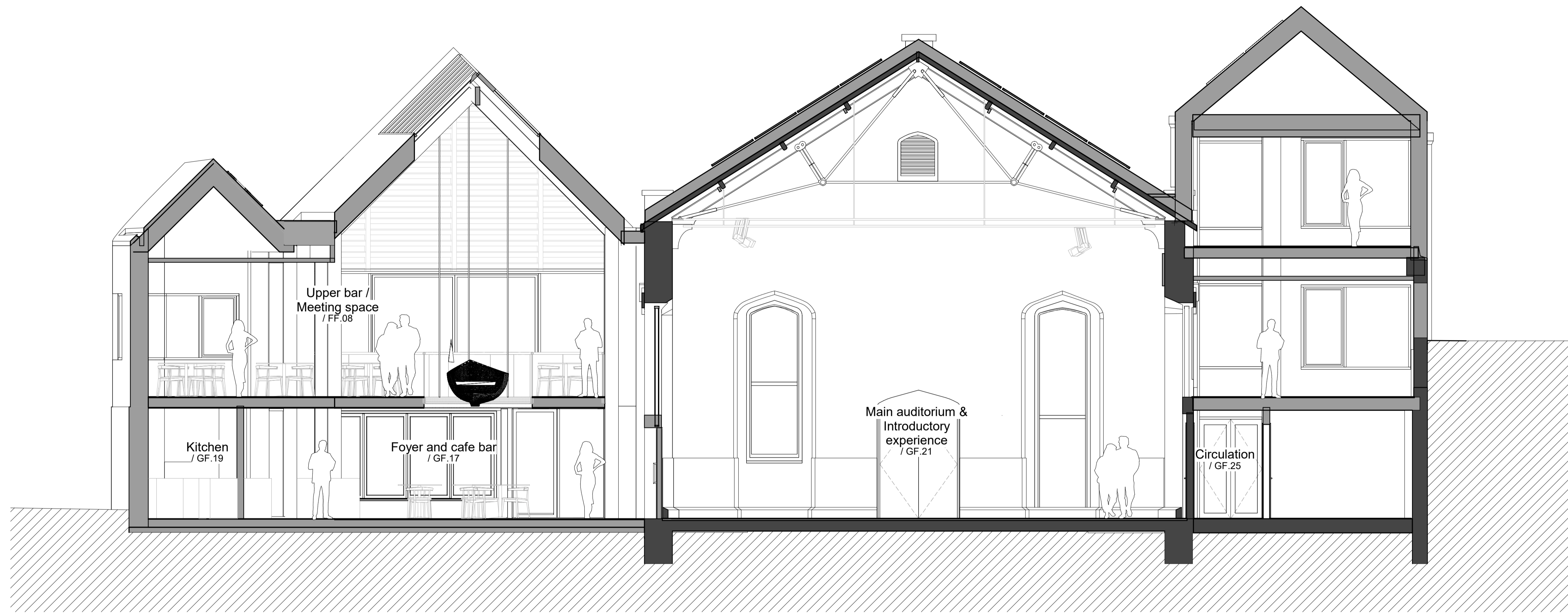
1 Section D-D 1 : 50

Notes: Drawings are based on survey data and may not accurately represent what is physically present. Do not scale from this drawing. All dimensions are to be verified on site before proceeding with the work. All dimensions are in millimeters unless noted otherwise. Purcell shall be notified in writing of any discrepancies.