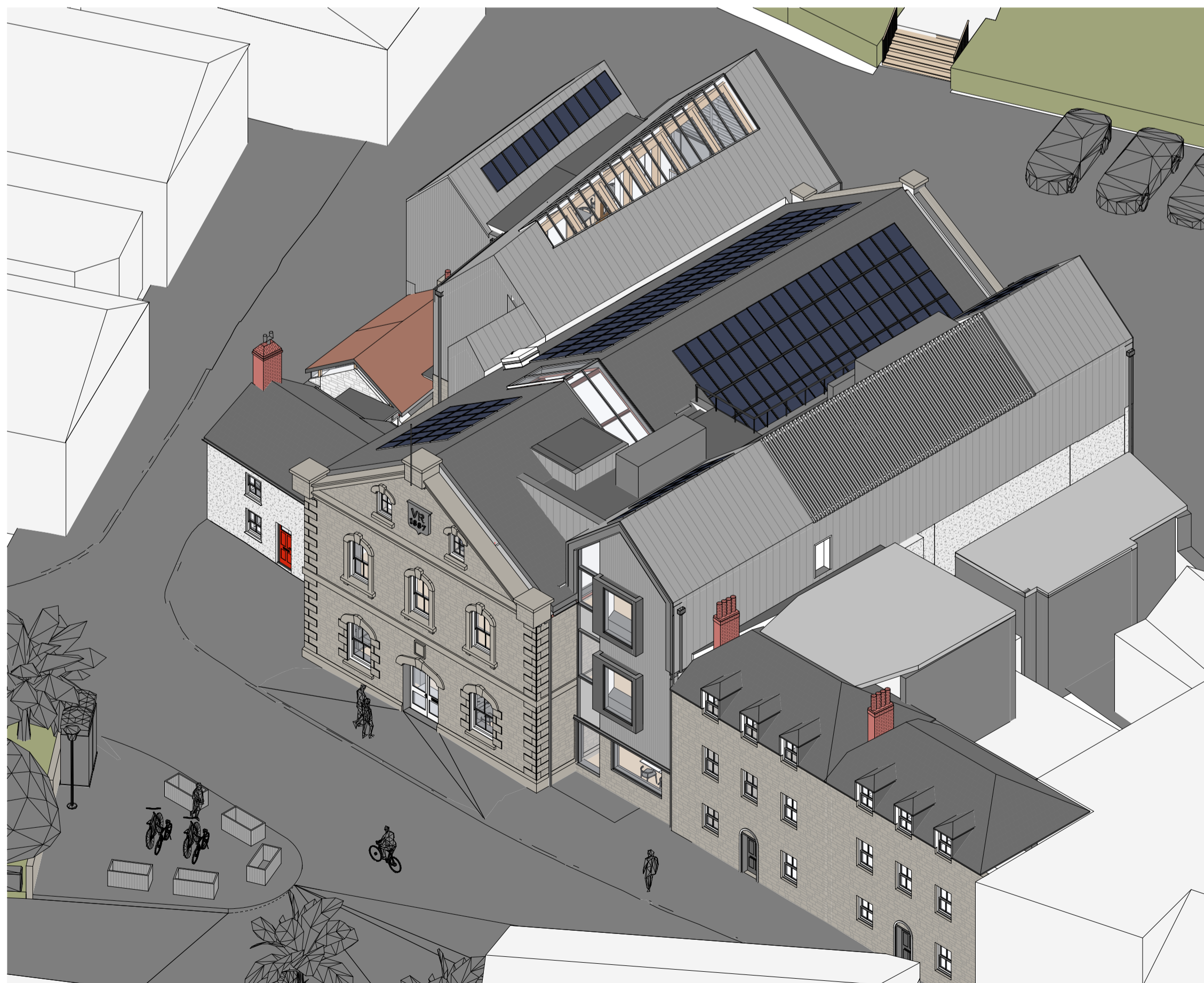
4 North West Axonometric

Notes: Drawings are based on survey data and may not accurately represent what is physically present. Do not scale from this drawing. All dimensions are to be verified on site before proceeding with the work. All dimensions are in millimeters unless noted otherwise. Purcell shall be notified in writing of any discrepancies.