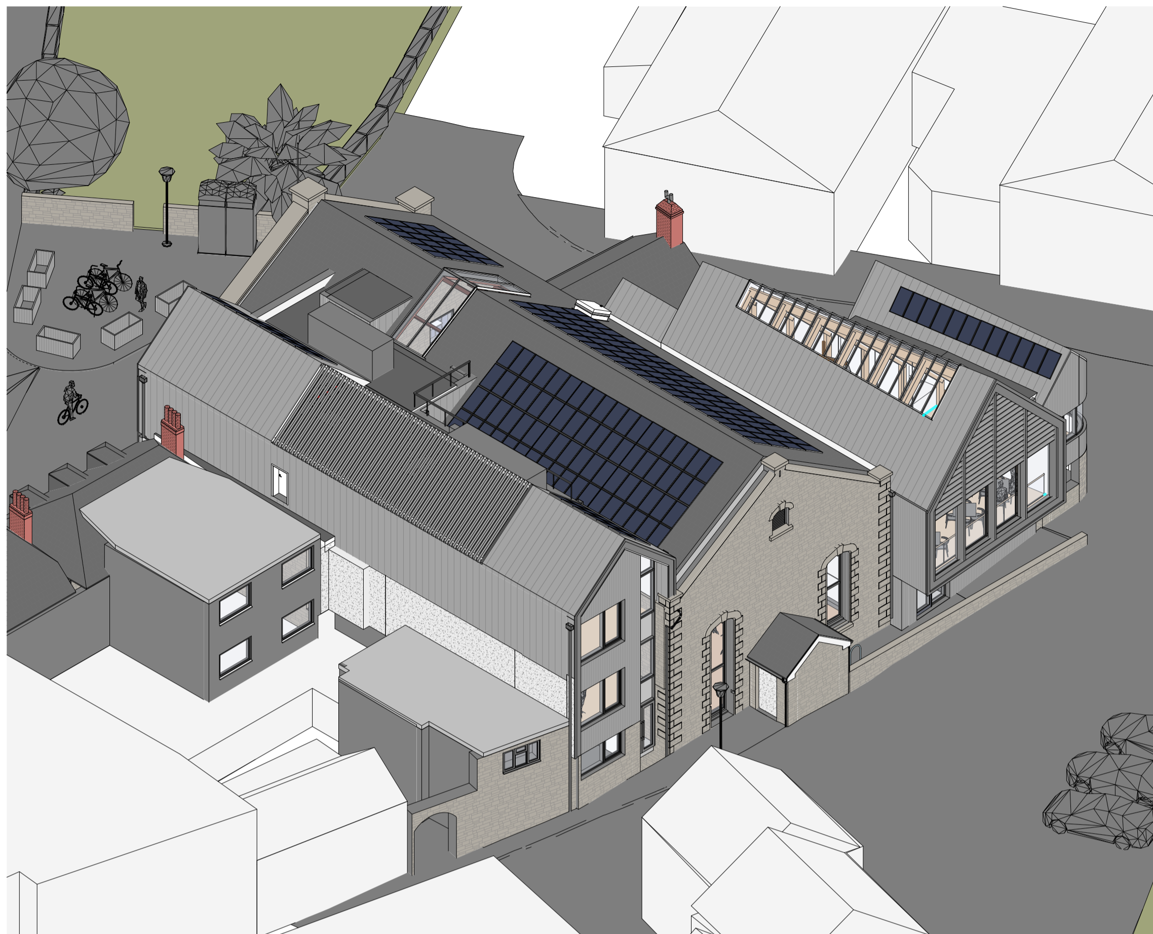
2 South East Axonometric