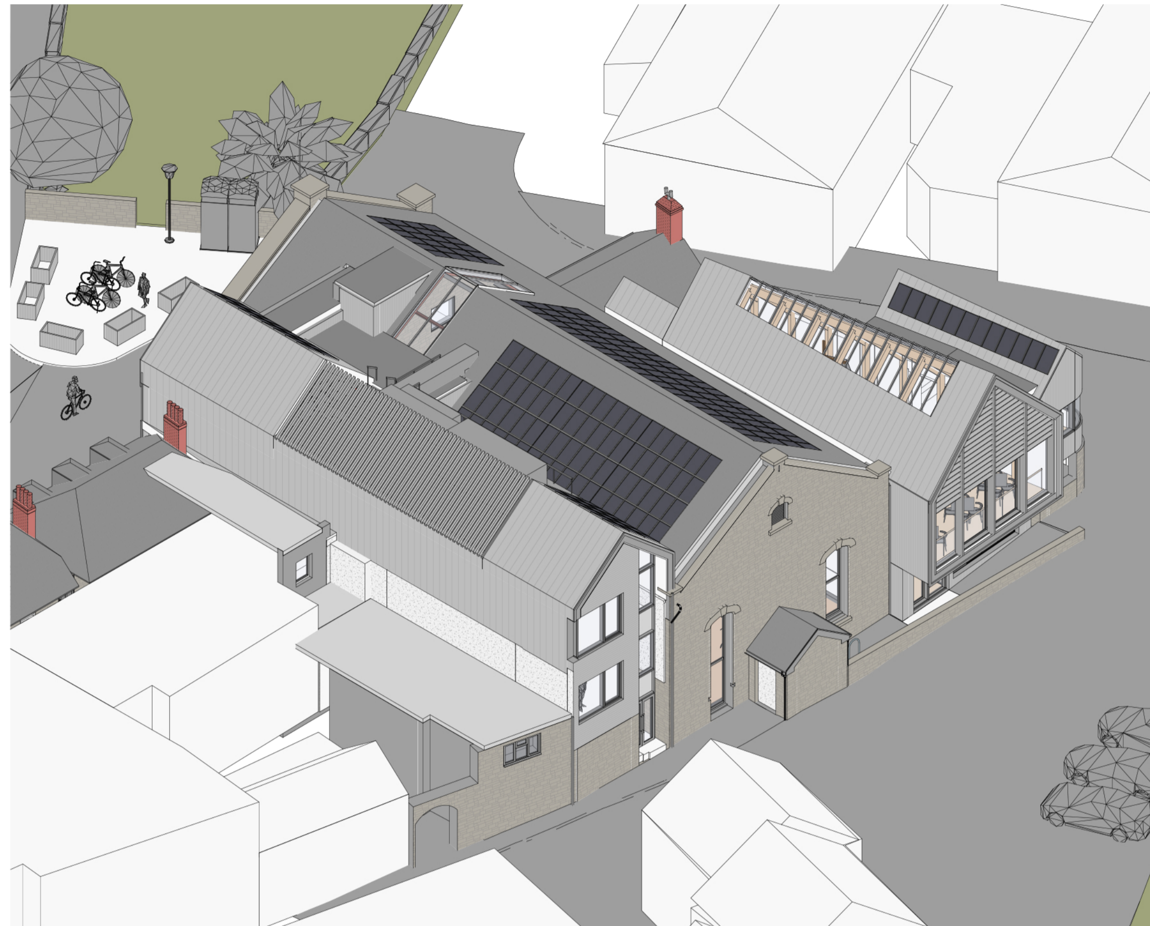
2 South East Axonometric