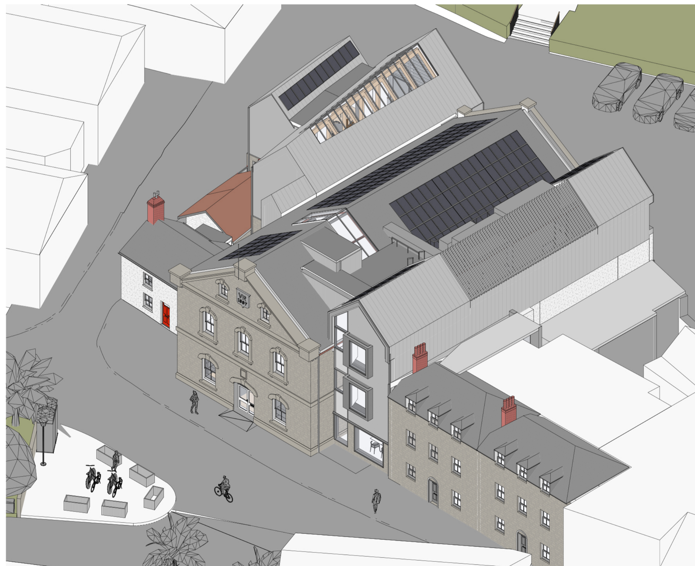
4 North West Axonometric

Notes: Drawings are based on survey data and may not accurately represent what is physically present. Do not scale from this drawing. All dimensions are to be verified on site before proceeding with the work. All dimensions are in millimeters unless noted otherwise. Purcell shall be notified in writing of any discrepancies.