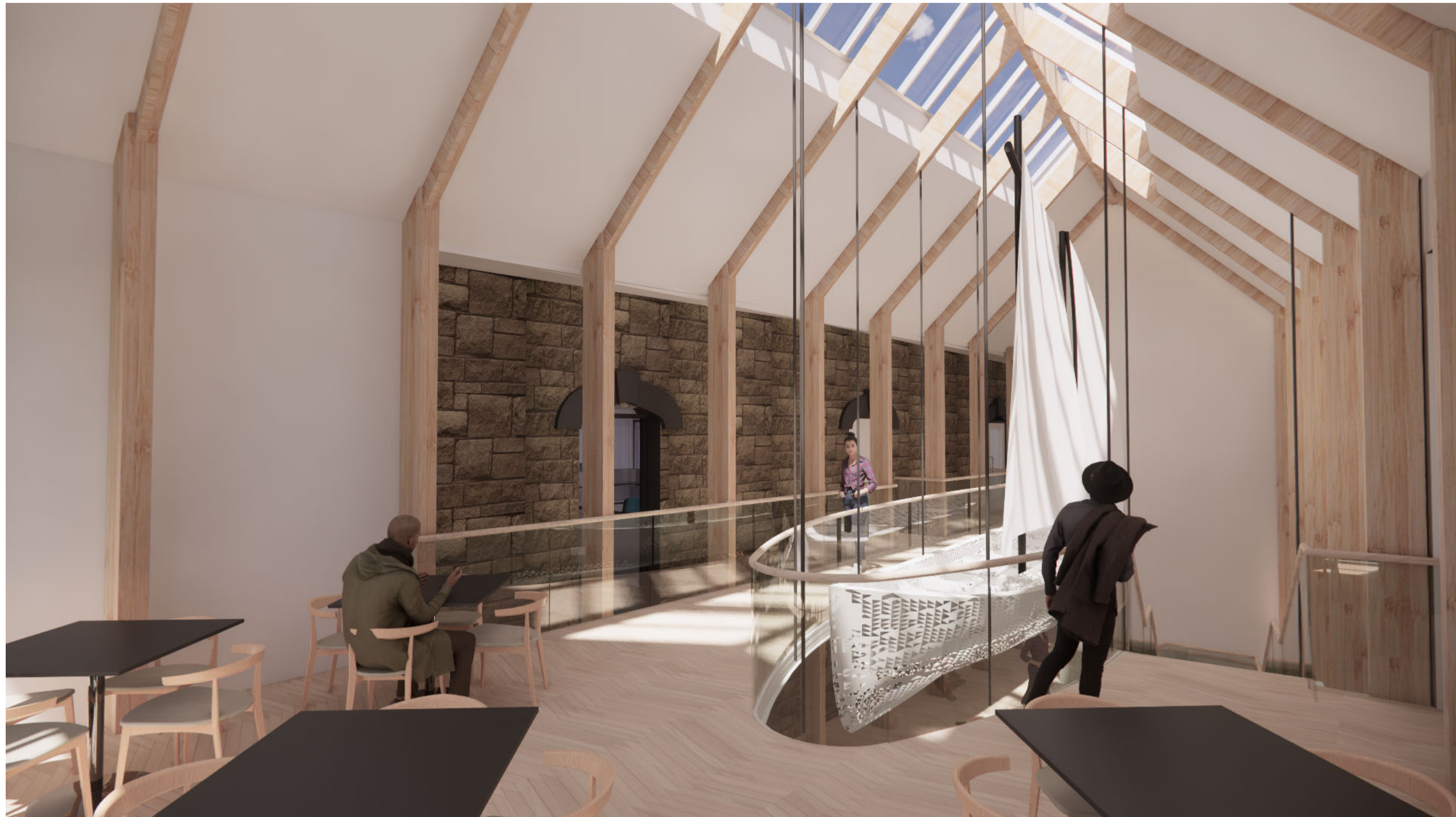
2 Boat Hall Gig Display 1:1