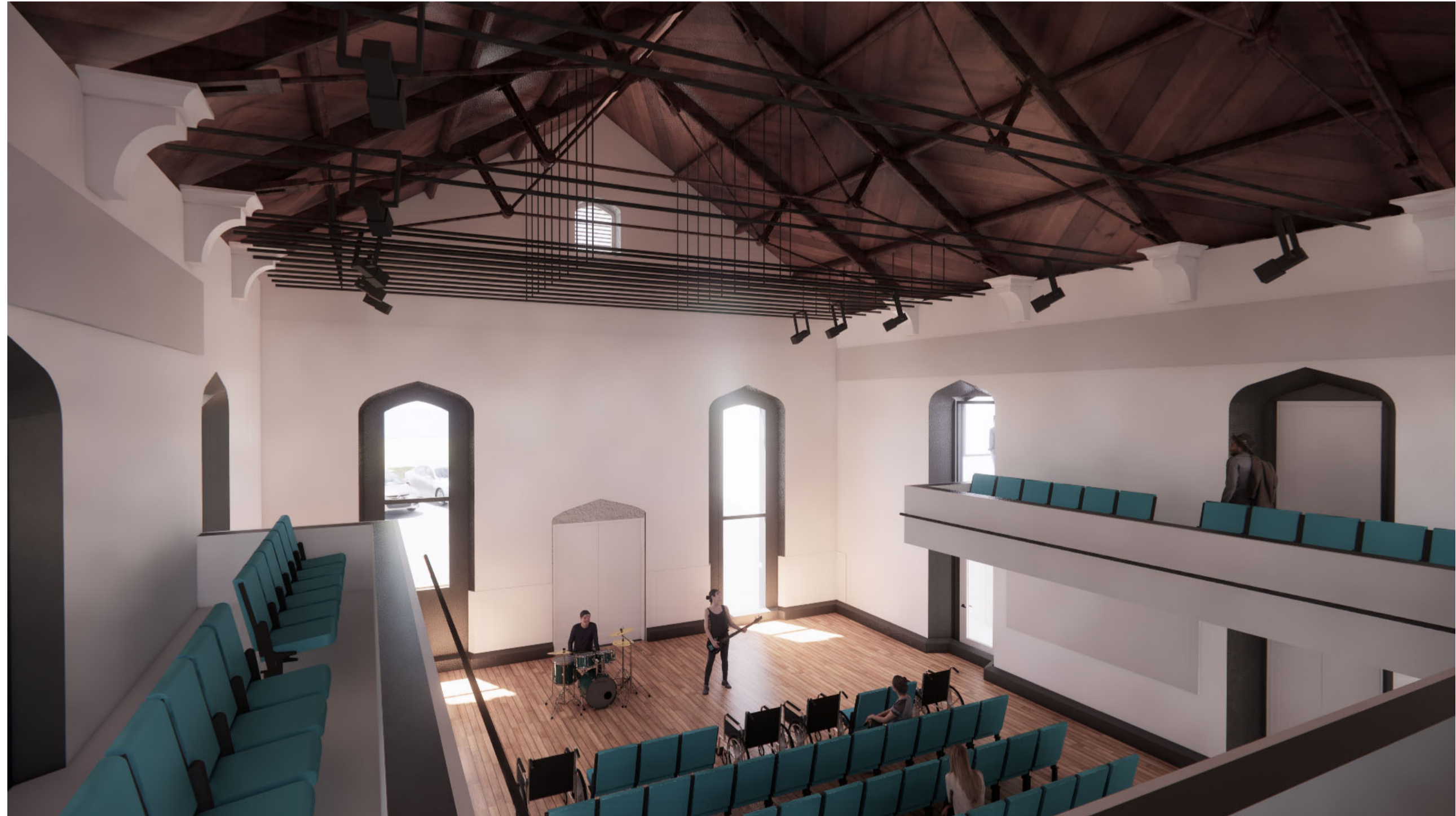
4 Auditorium from balcony 1:1