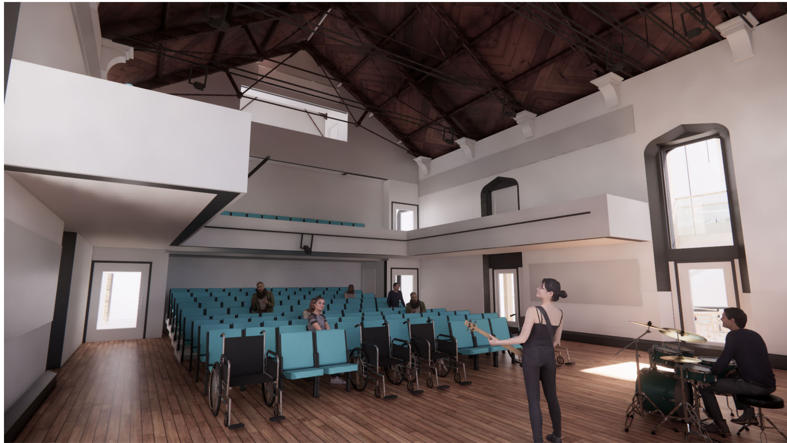
3 Auditorium 1:1