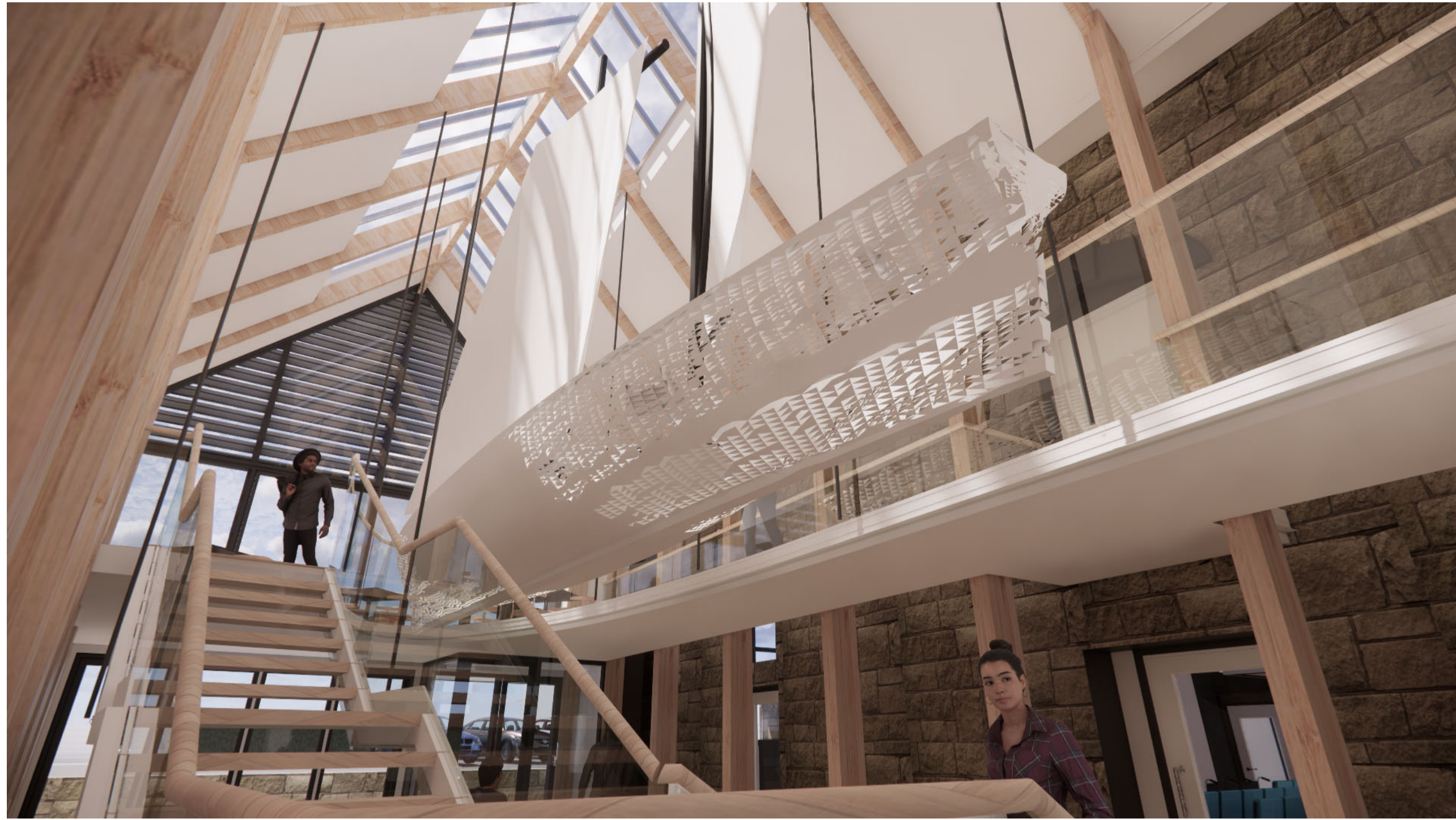
1 Boat Hall Cafe 1:1