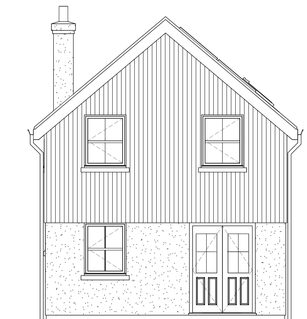
Rear Elevation Planning 1 : 50