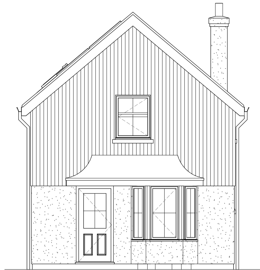
Front Elevation Planning 1 : 50

RECEIVED By A King at 11:07 am, Aug 21, 2023