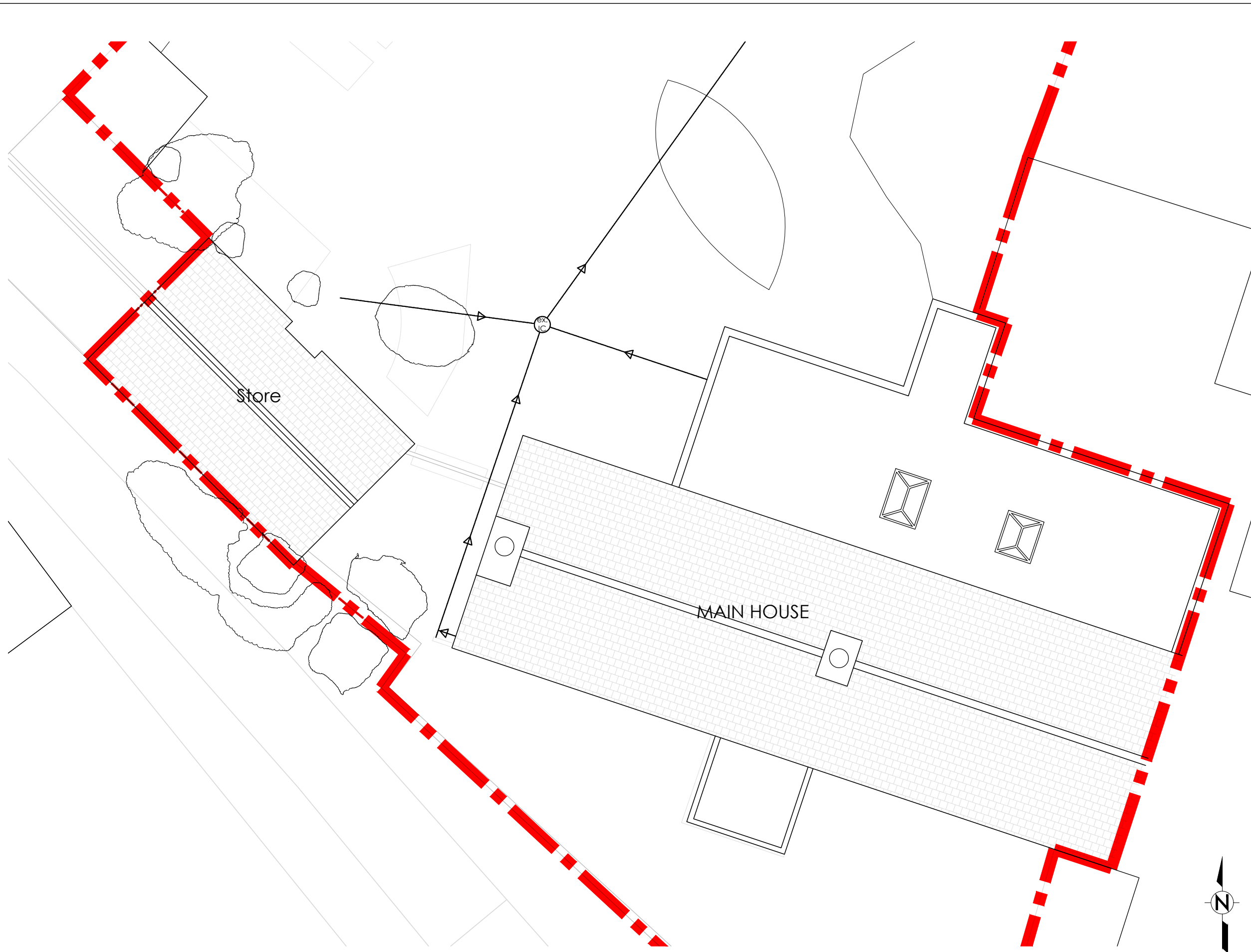
Existing Roof Plan 1:100