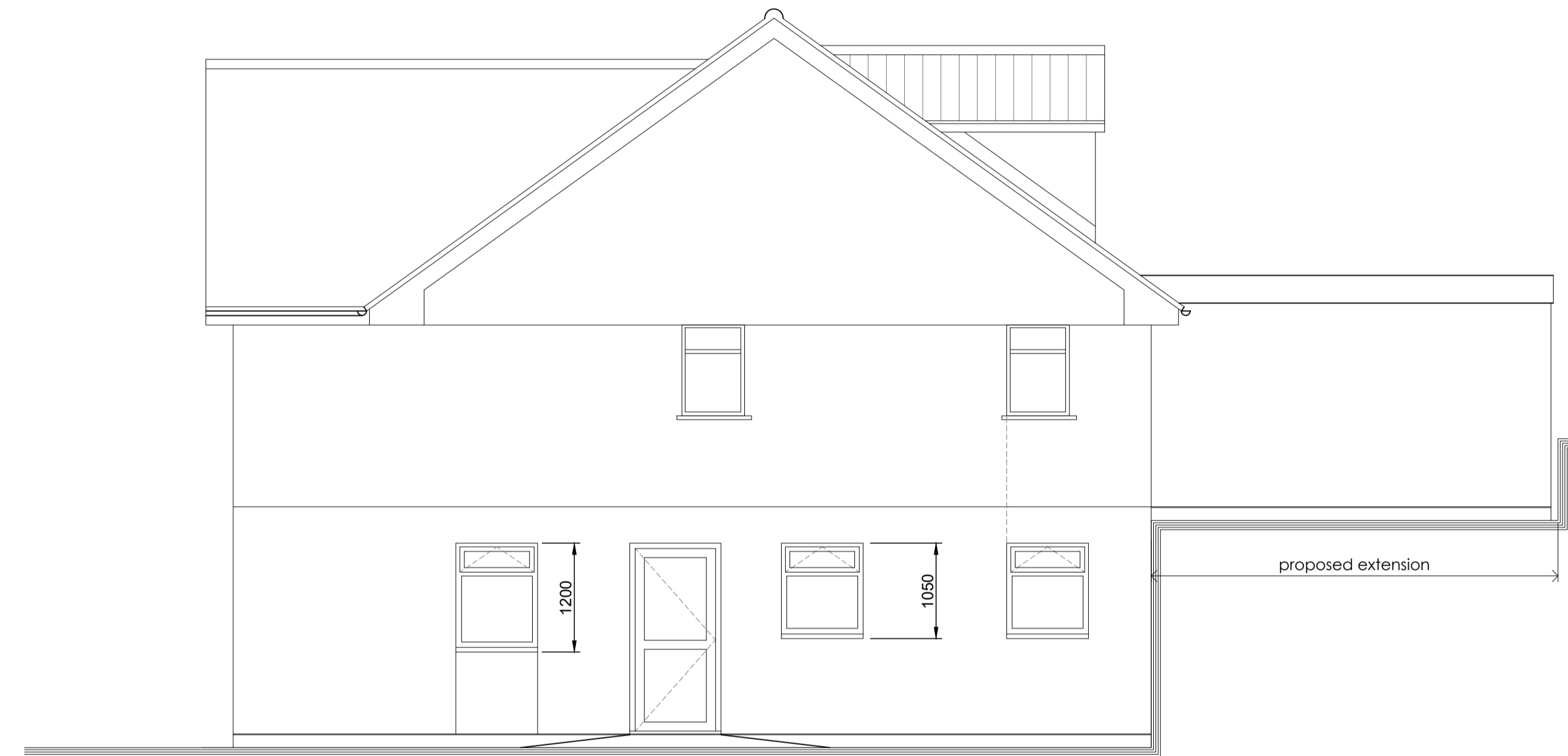
North Elevation No. 2