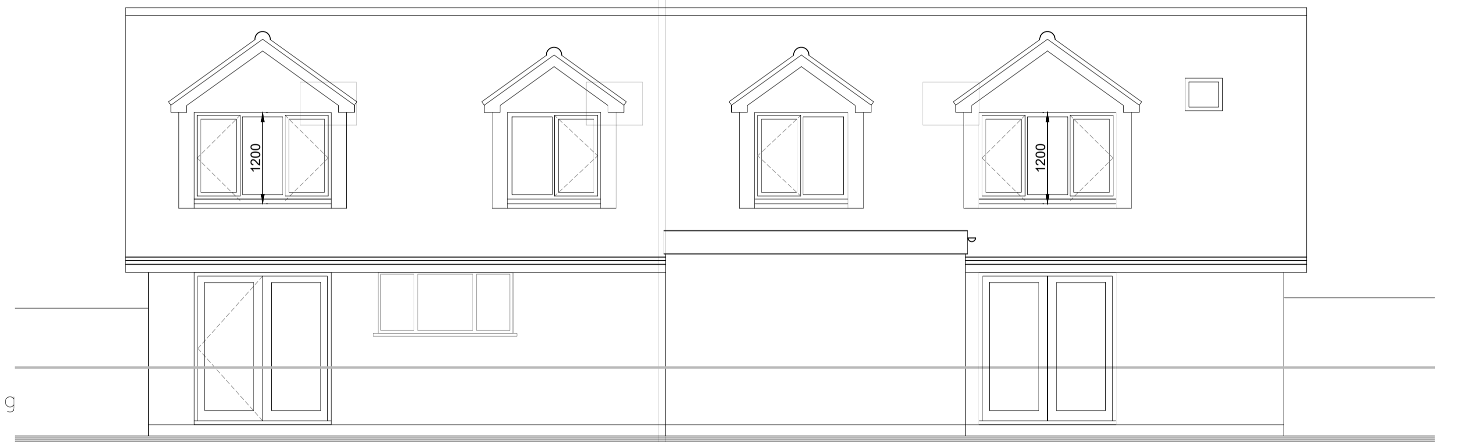
West (Rear) Elevation

PROJECT TITLE: PROPOSED DIVISION OF SINGLE DWELLING INTO TWO BEVERLY HILLS, PILOTS RETREAT, ISLES OF SILLY FOR MR PETER GREEN