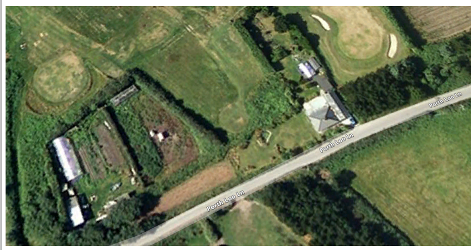
2005 Aerial View