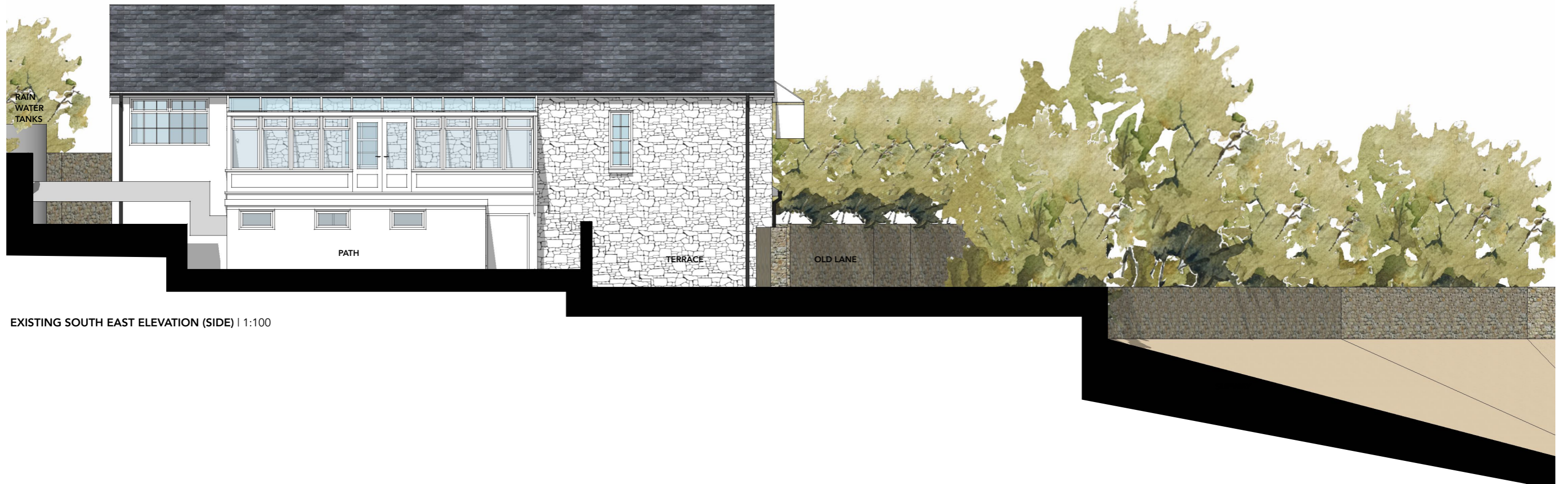
EXISTING SOUTH EAST ELEVATION (SIDE) | 1:100