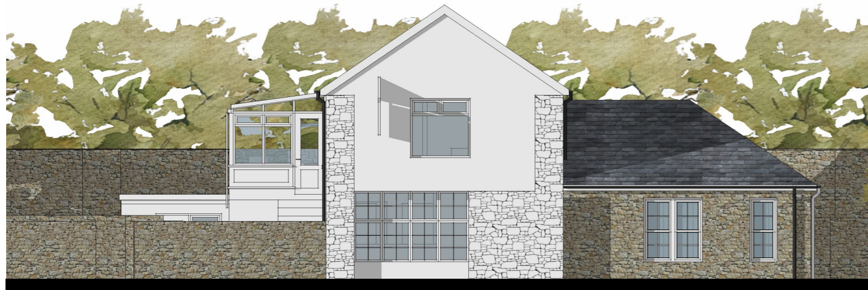
EXISTING NORTH EAST ELEVATION (ROADSIDE) | 1:100