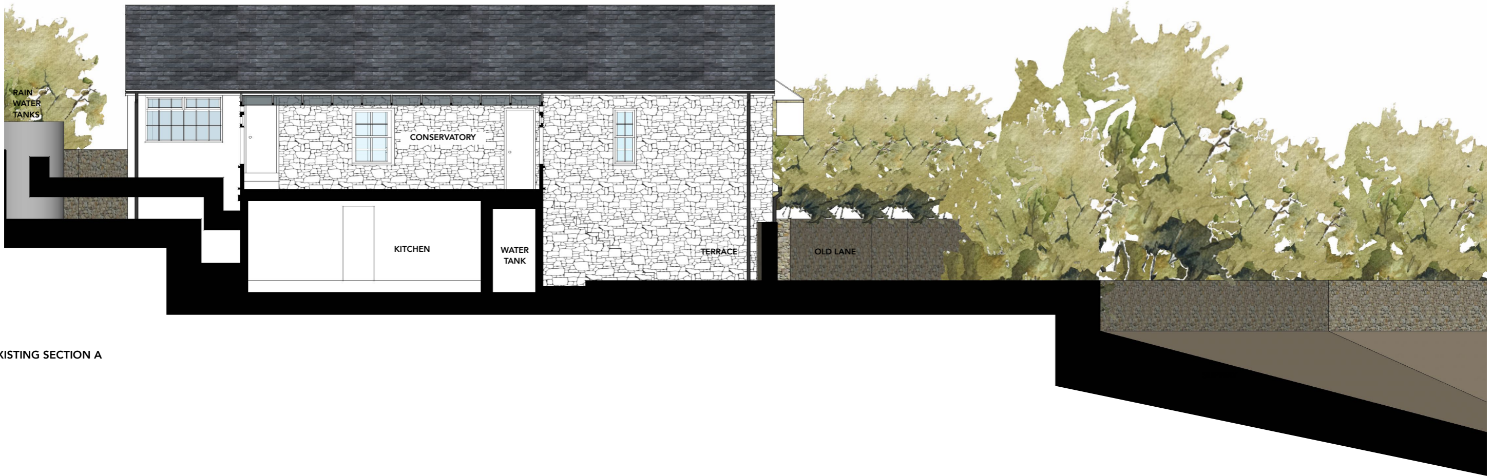
EXISTING SECTION A