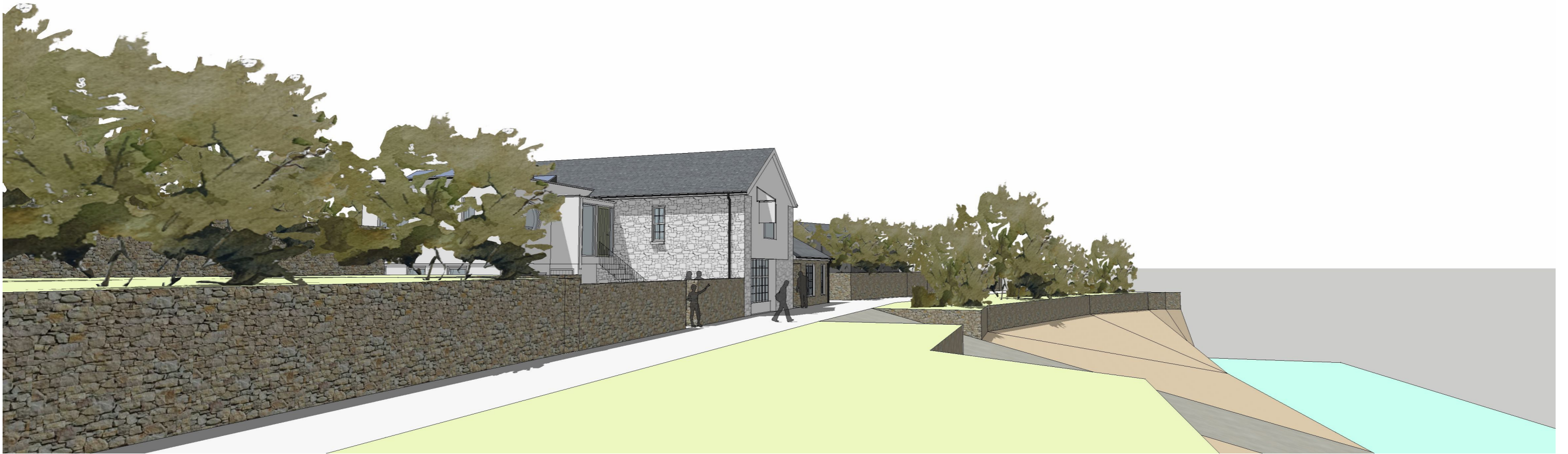
PROPOSED VIEW FROM THE GARDEN TERRACE