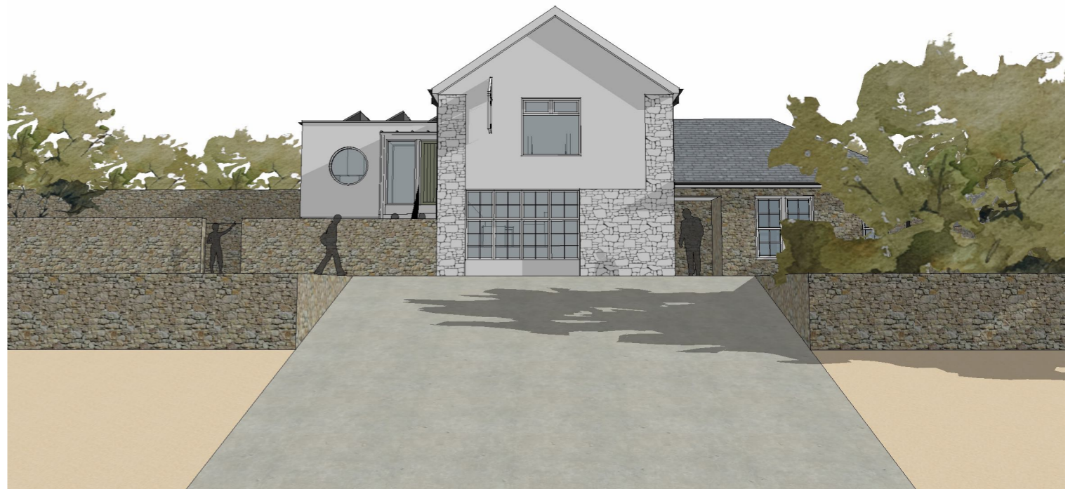
PROPOSED VIEW FROM THE SLIPWAY