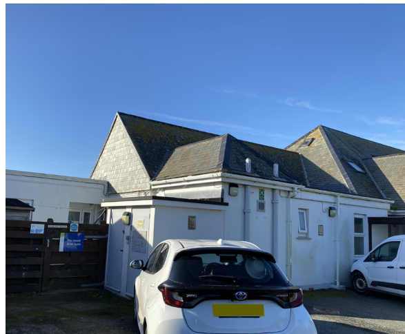
View of Hospital Roof entering from main vehicle entrance