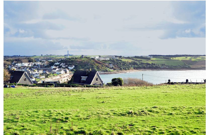
Panoramic view of Hospital from across the bay towards Porthcressa Beach

We have attempted to reduce the impact on the stone plinths the two new extensions are positioned with soft landscaping and open glazed balustrades.