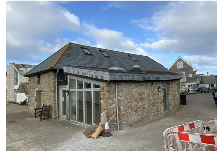
Dibble and Grub, situated on Portcressa Beach