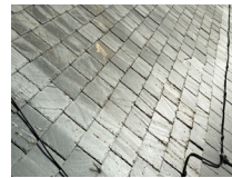
Grey Slate Roof