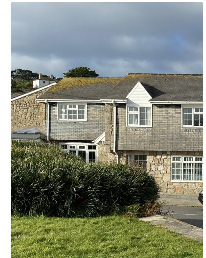
View of houses on Church Road