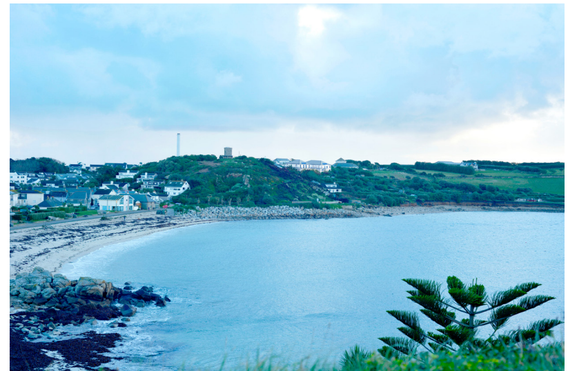
Panoramic view of Hospital from across the bay towards Porthcressa Beach from Upper Benham Battery.