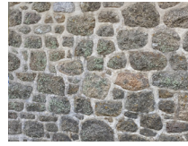
Native Granite Stone

Through this analysis, and the supporting typologies native to the Isles, our decision to reuse the same materials in the proposed design will not only ensure a seamless blend, but will be long wearing, as proven by the existing materials.