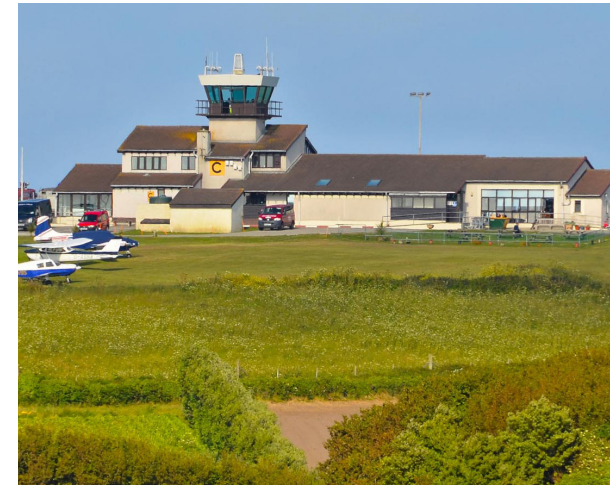
St Marys Airport