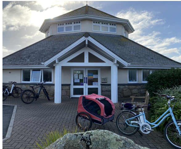
St Marys Health Centre

The scenic views from the care home to the beautiful coastline have been maximised with the use low window sills. We have introduced garden courtyards to support the care home residents and hospital patients health and wellbeing whilst they reside in the facility.