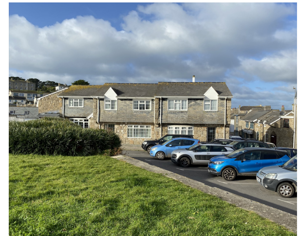
View of houses on Church Road