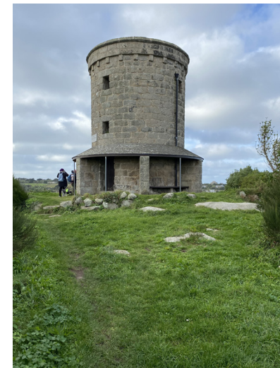
Buzza Hill Dolmen