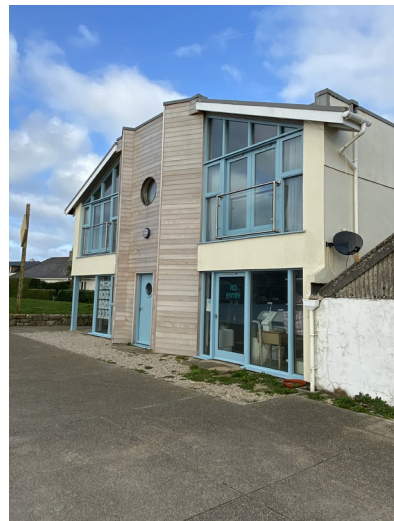
Portcressa Public Library