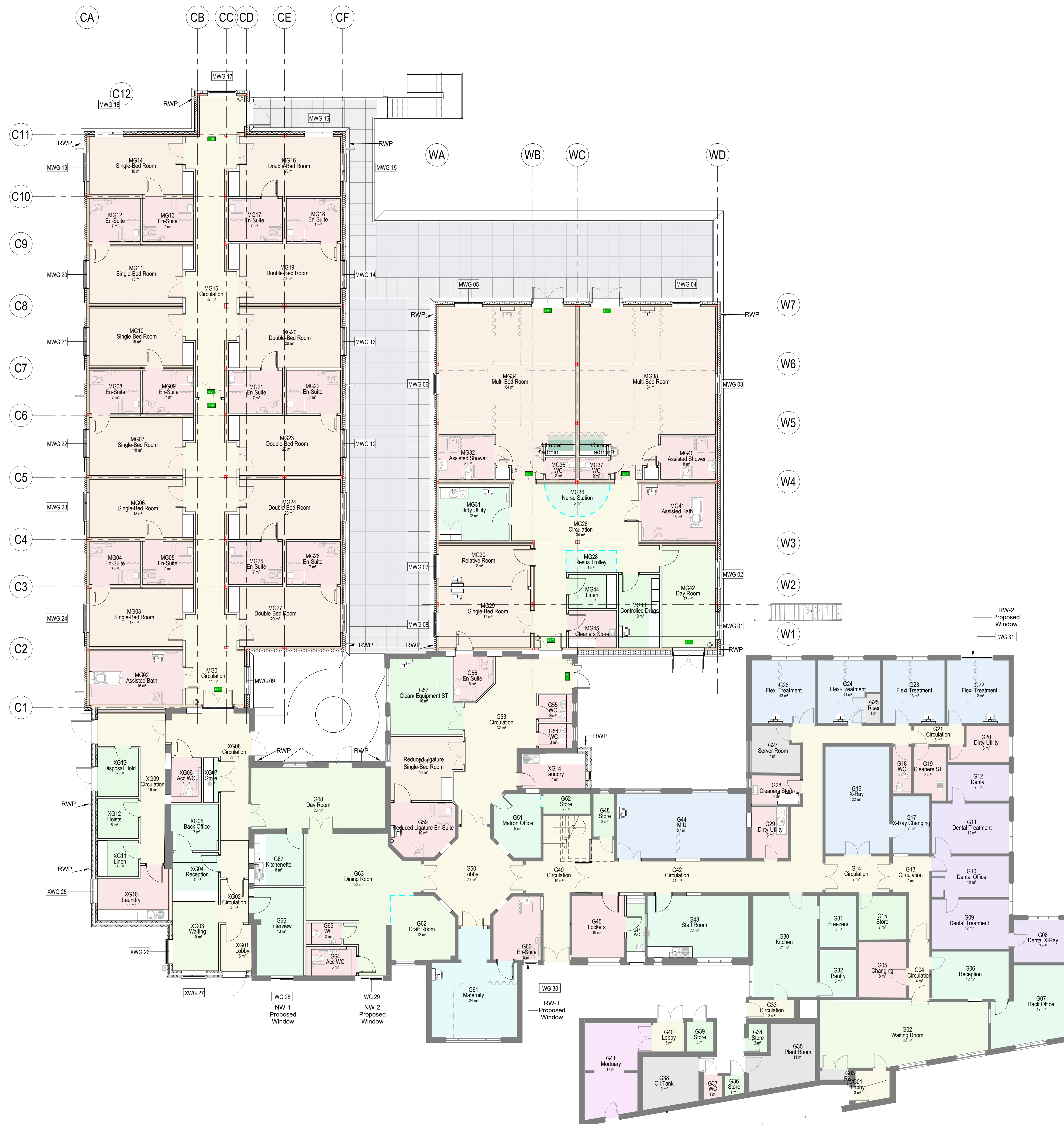
Proposed Ground Floor Plan 1 : 100