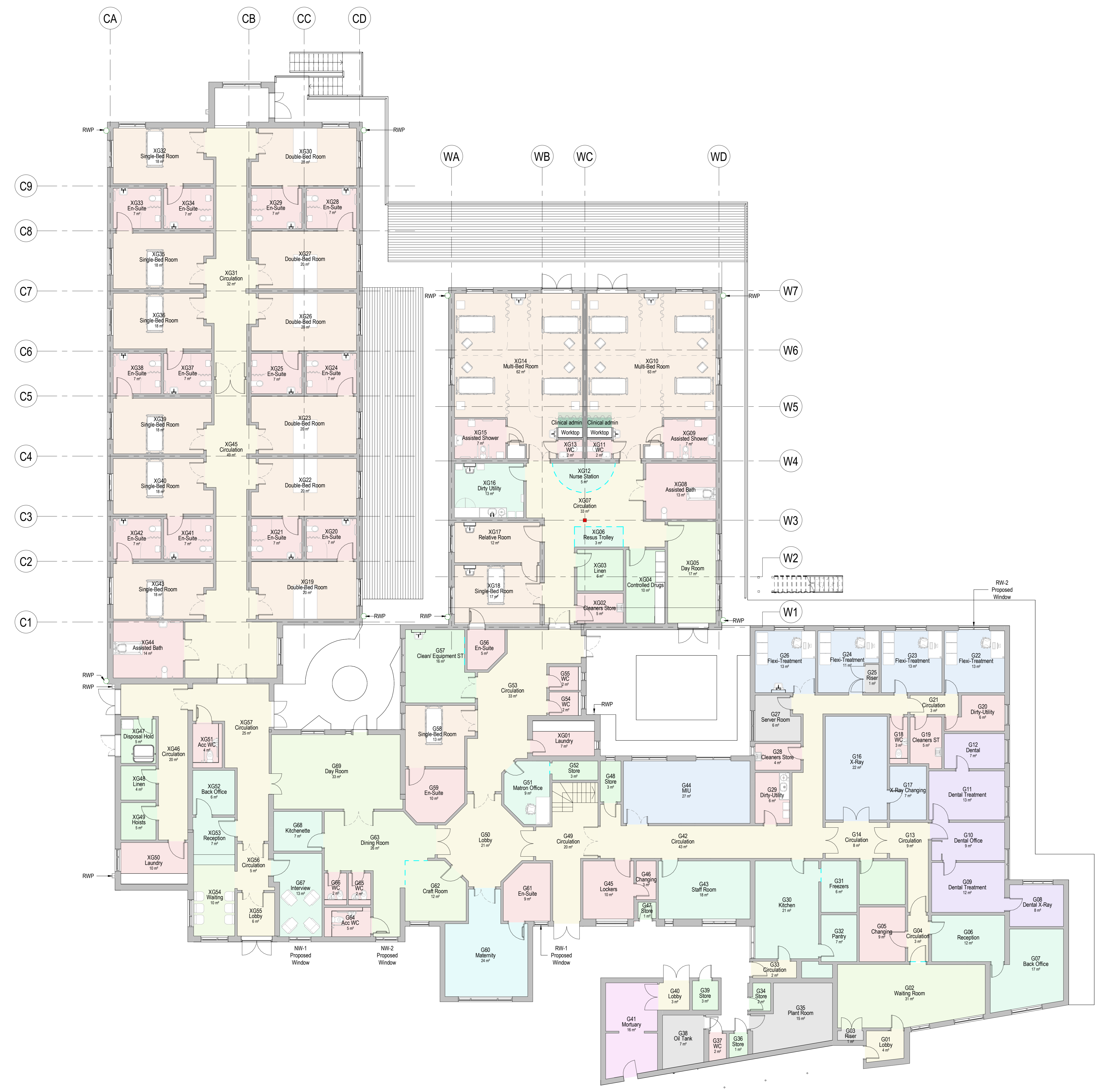
Proposed Ground Floor Plan 1 : 100