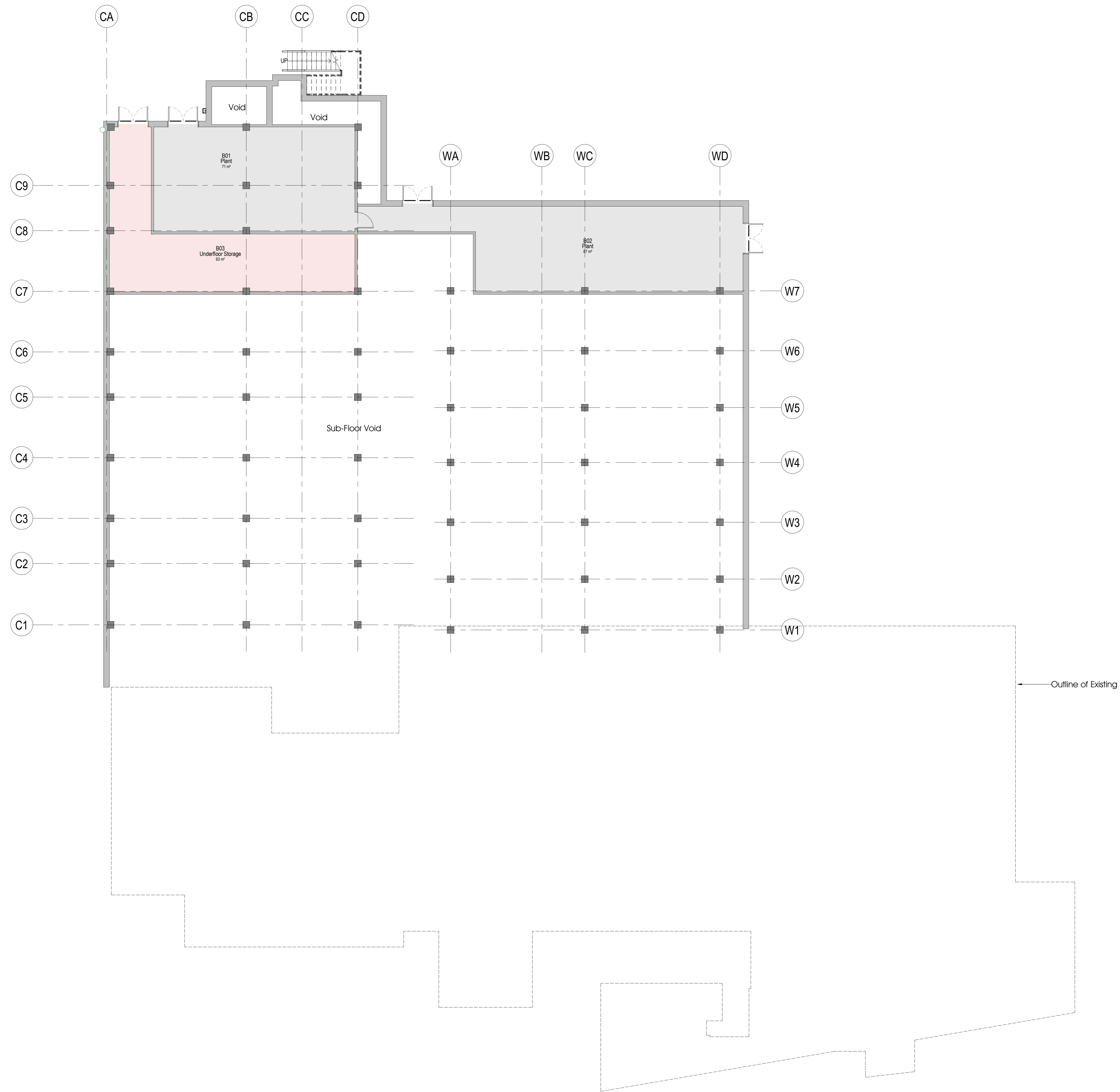
Basement Plan 1:100