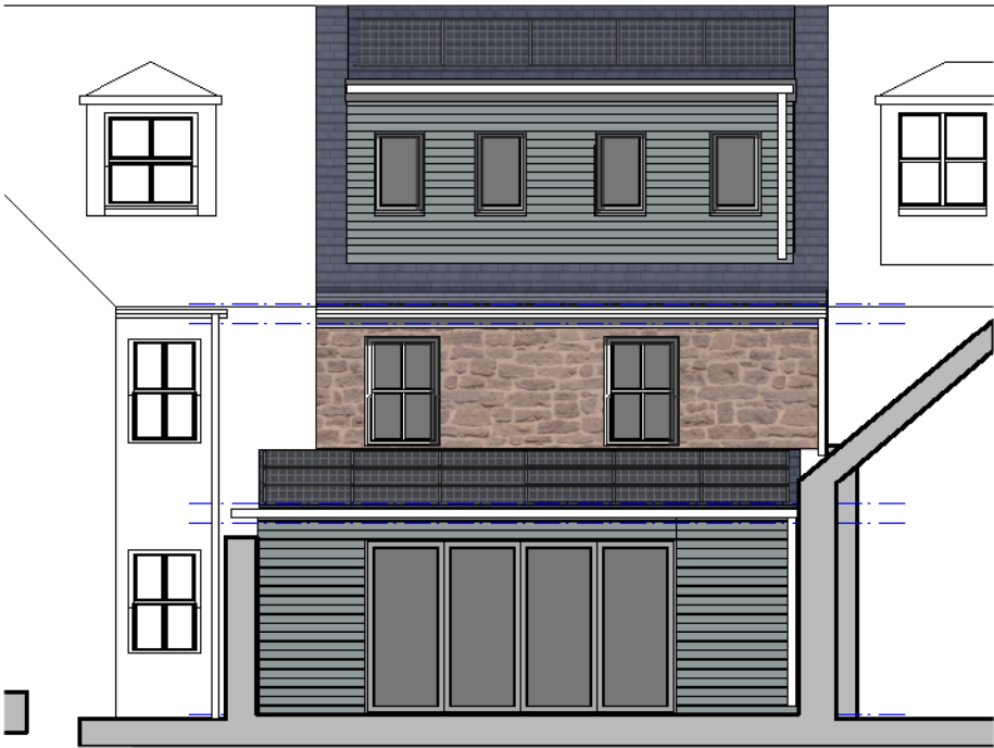
12 Prelim Rear Elevation Scale: 1:100