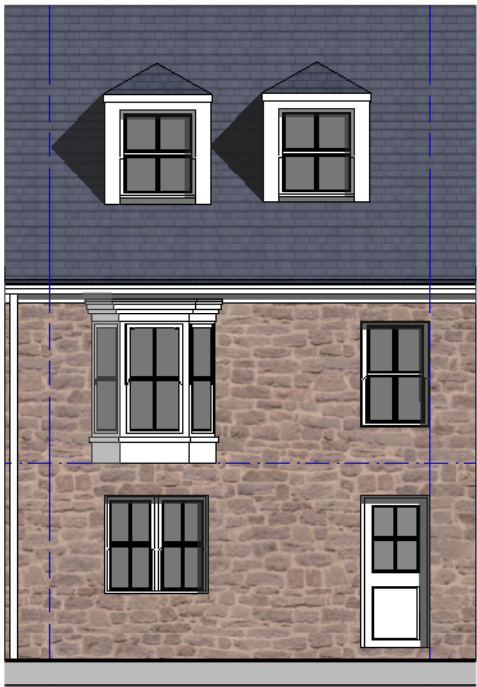
11 Prelim Front Elevation Scale: 1:100