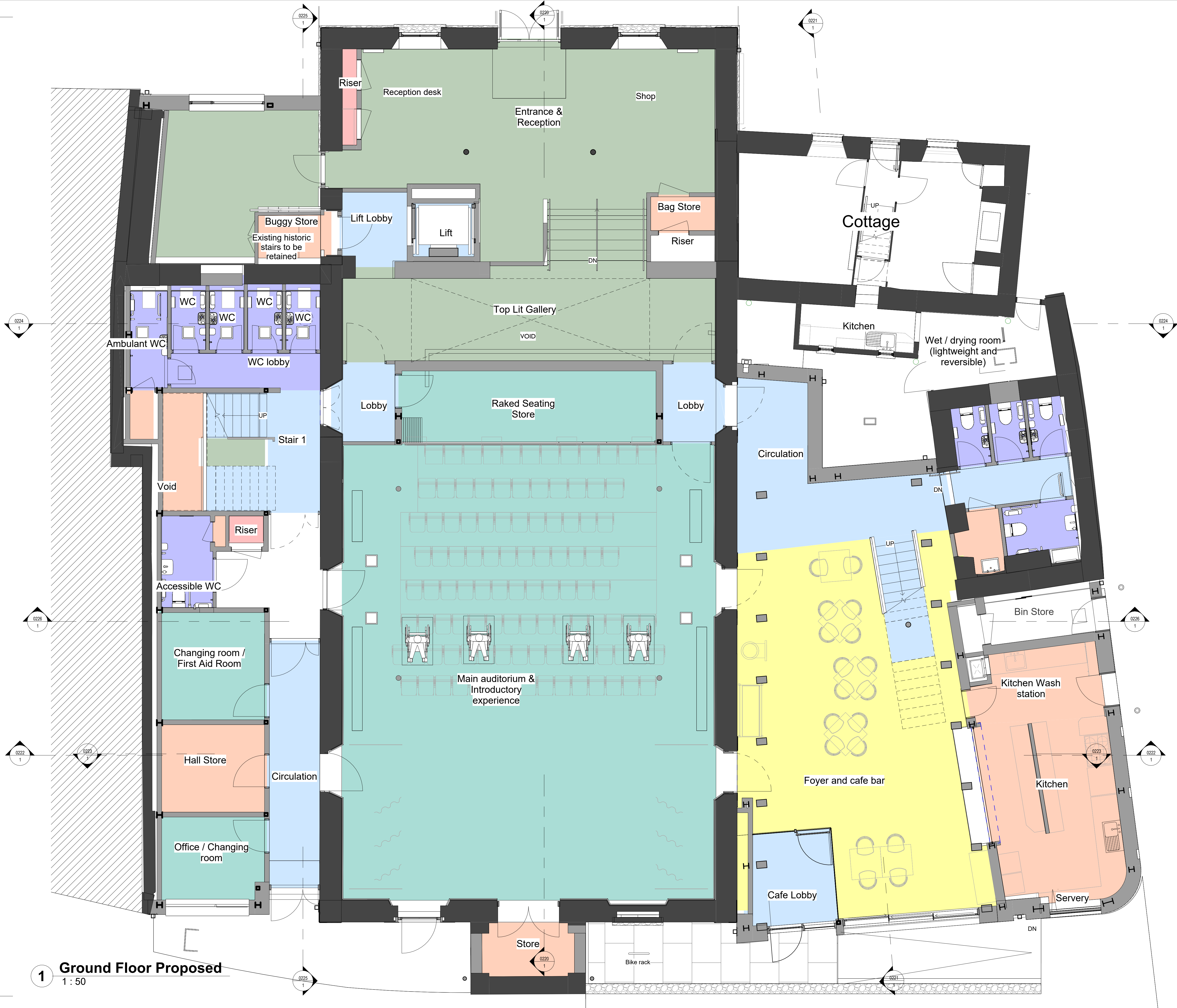
1 Ground Floor Proposed 1 : 50

Notes: Drawings are based on survey data and may not accurately represent what is physically present.