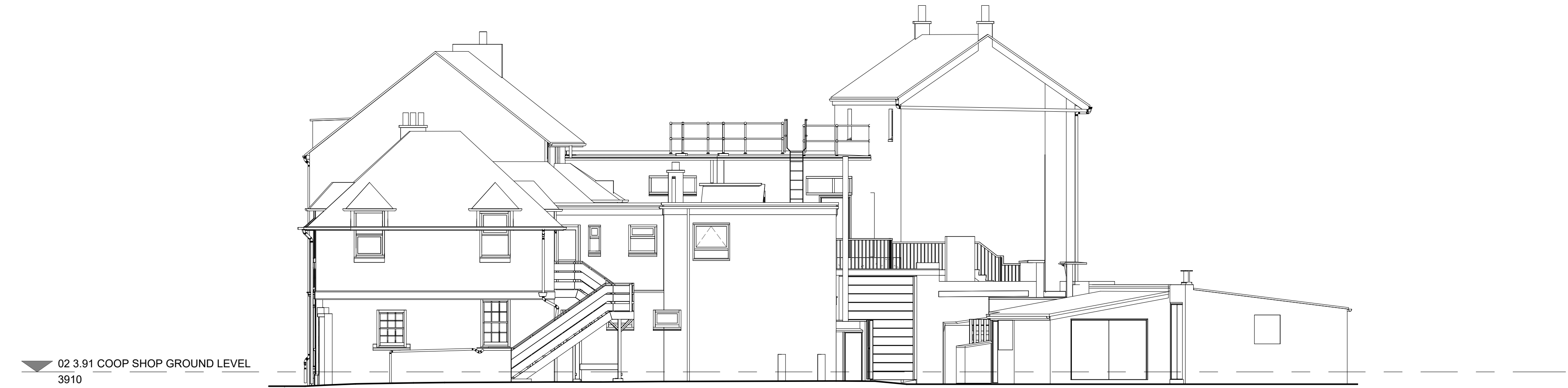
2 - Existing South East Elevation-2 1 : 100