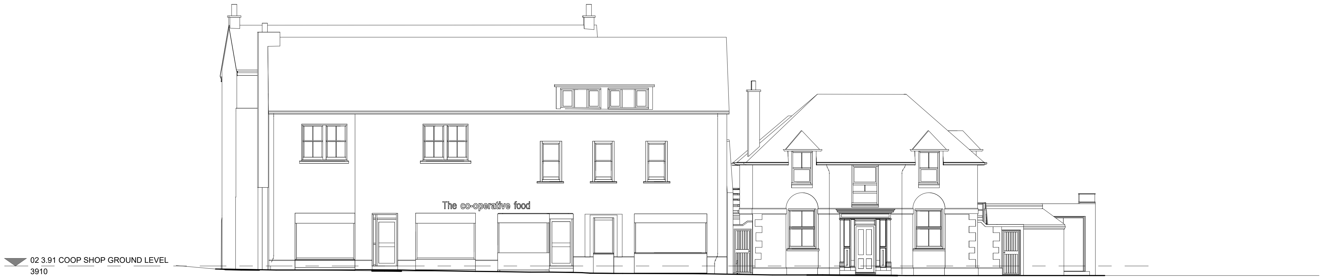
4 - Existing South West Elevation -4 1 : 100

RECEIVED By Tom.Anderton at 9:29 am, May 29, 2025