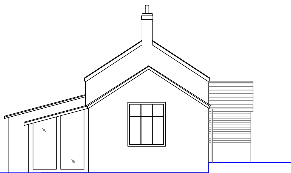
Existing Side 1 Elevation Scale 1:100