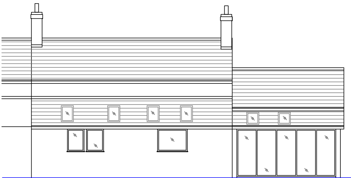
Existing Rear Elevation Scale 1:100