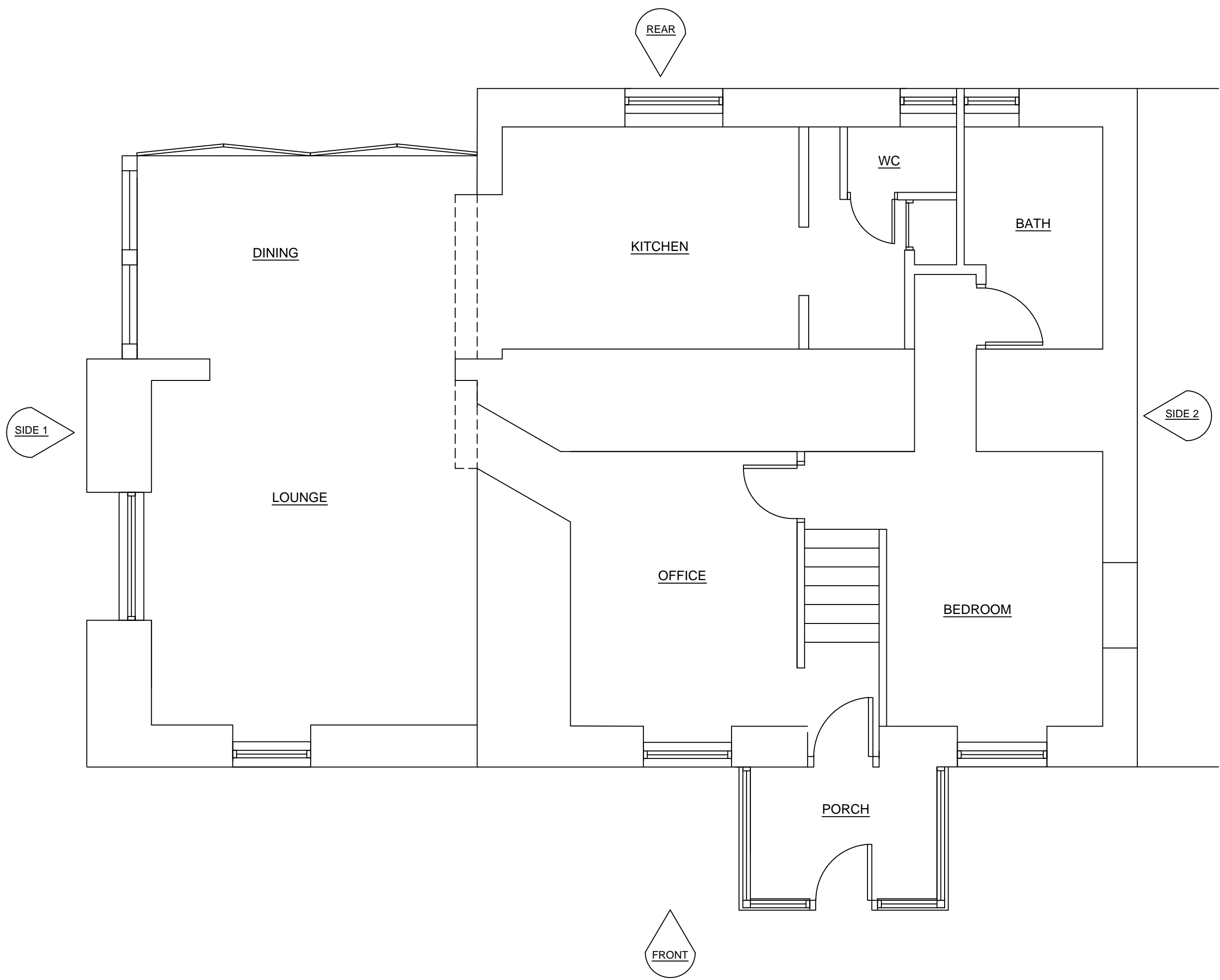
Existing Ground Floor Plan Scale 1:50