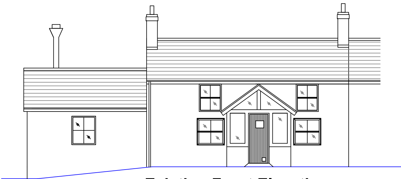
Existing Front Elevation Scale 1:100

Do not scale off this drawing All dimensions to be checked on site. Any discrepancy between drawn and specified information to be notified immediately. The Contractor is to check and clarify all dimensions, levels, drainage construction and materials specification prior to any works starting on site. Any discrepancies are to be brought to the Clients attention prior to commencing on site. All materials should be installed as per manufacturers instructions, recommendations and specifications.