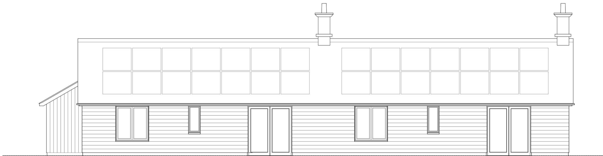
TERRACE A - SOUTH ELEVATION