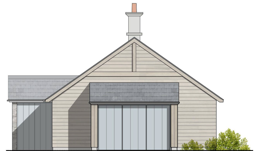
TERRACE A - WEST ELEVATION