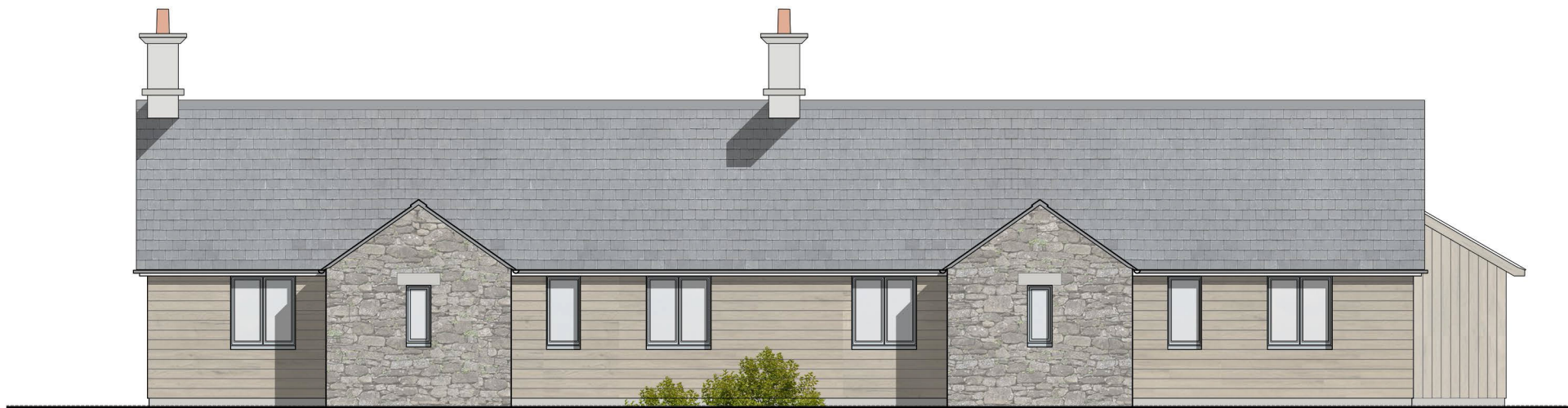
TERRACE A - NORTH ELEVATION