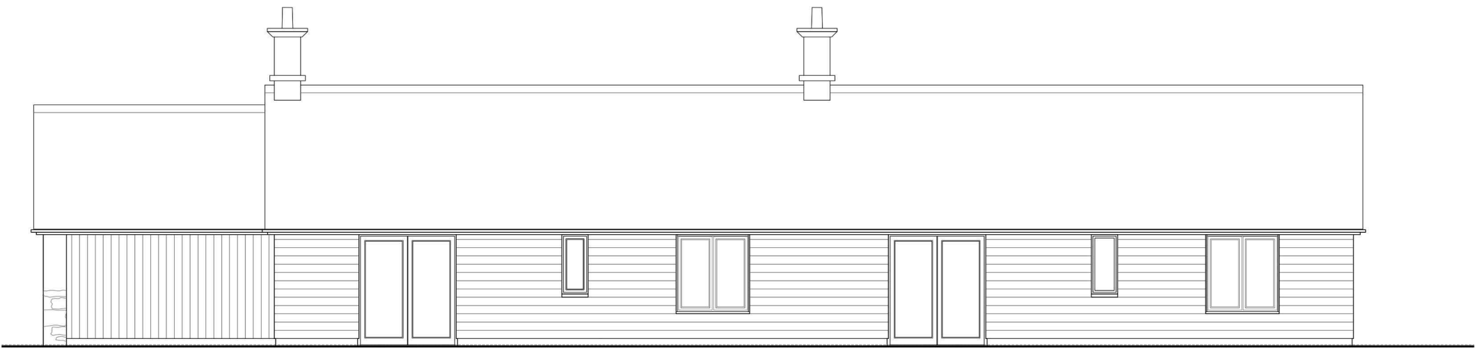
TERRACE B - WEST ELEVATION