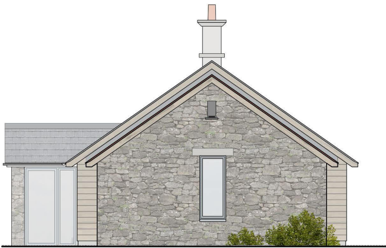
TERRACE B - NORTH ELEVATION

RECEIVED By Tom.Anderton at 11:04 am, Aug 01, 2025