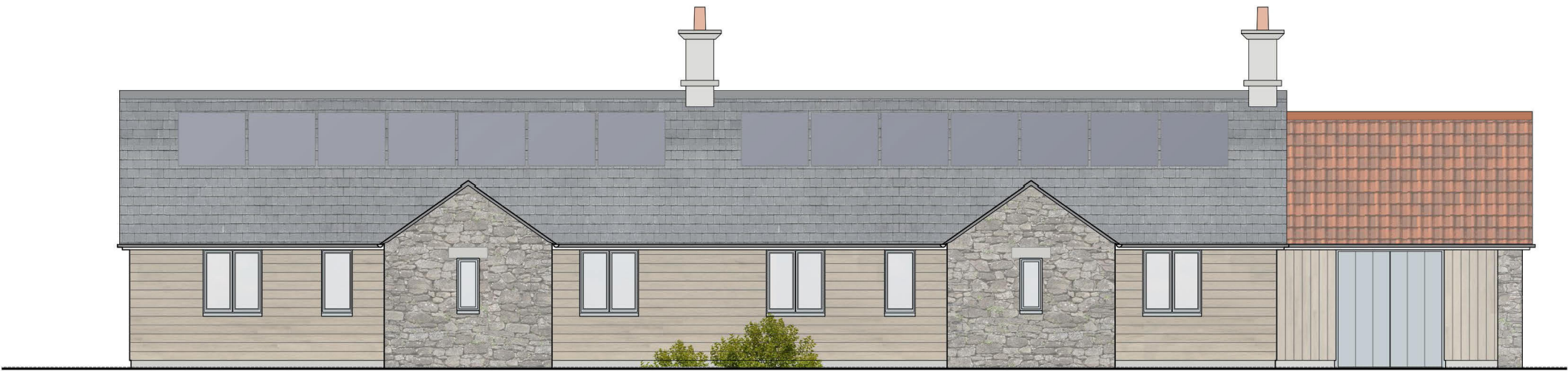
TERRACE B - EAST ELEVATION