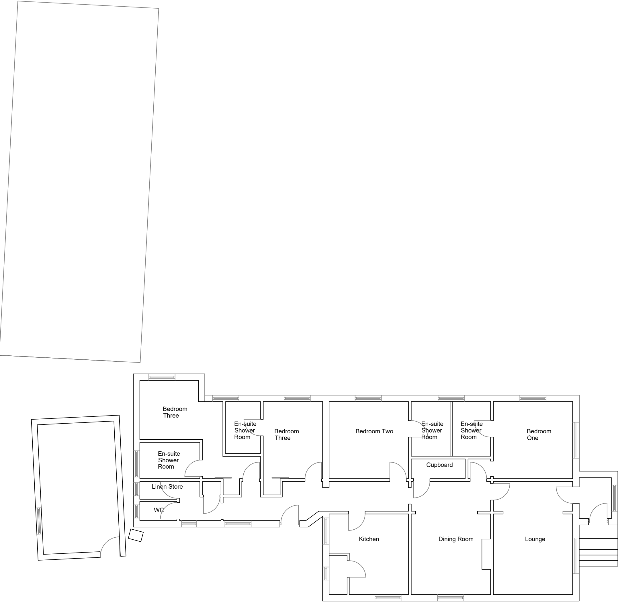
Existing Ground Floor Plan