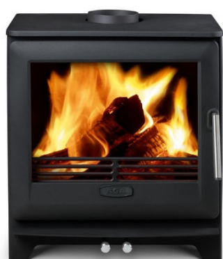
Image showing Aga Ludlow stove

An Aga Ludlow Wide wood burning stove is proposed for the Living Room along with a new stainless steel flexible liner to be fitted inside the existing flue within the chimney stack.