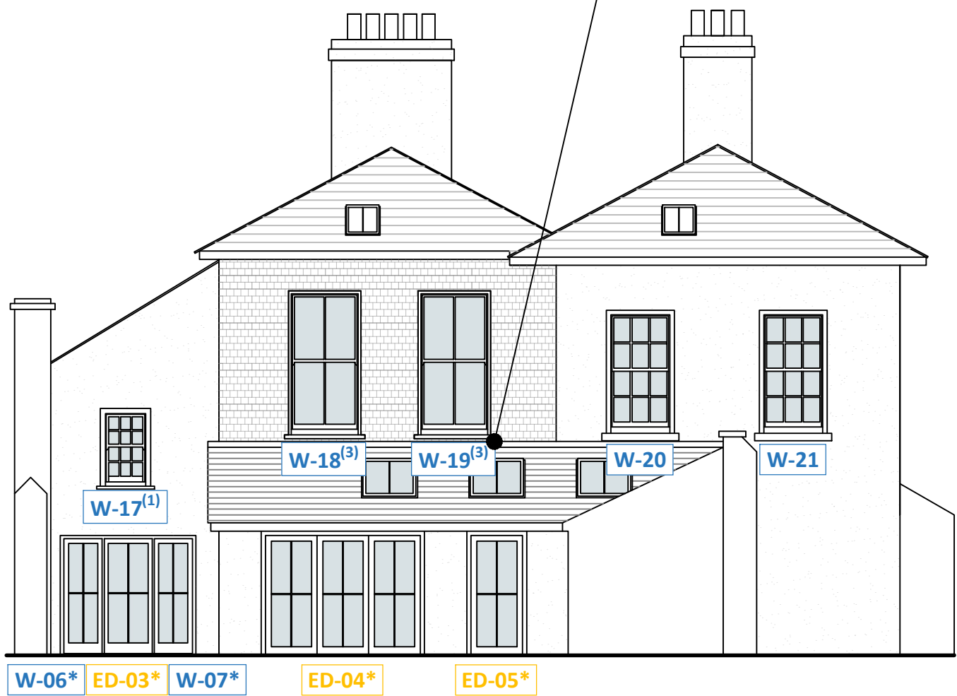
03 NORTH ELEVATION

GROUPS 1 & 2 SHARE MATCHING GLAZING BAR PROFILES, WITH DIFFERENTIATIONS BEING MADE BASED ON HORN PROFILES.