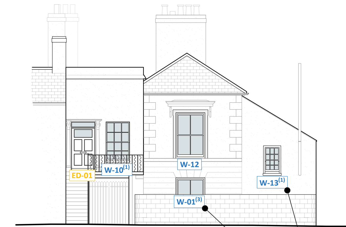
01 SOUTH ELEVATION

DRAWINGS TO BE READ IN CONJUNCTION WITH JOINERY REPORT, SCHEDULE AND ALL DETAILED WINDOW DRAWINGS. GROUP TYPE (1) - ROUNDED HORN PROFILE Please refer to drawing 3528-1-500 for typical group 1 details and defects. GROUP TYPE (2) - ANGULAR HORN PROFILE Please refer to drawing 3528-1-501 for typical group 2 details and defects. GROUP TYPE (3) - CONCAVE HORN PROFILE Please refer to drawing 3528-1-502 for typical group 3 details and defects.