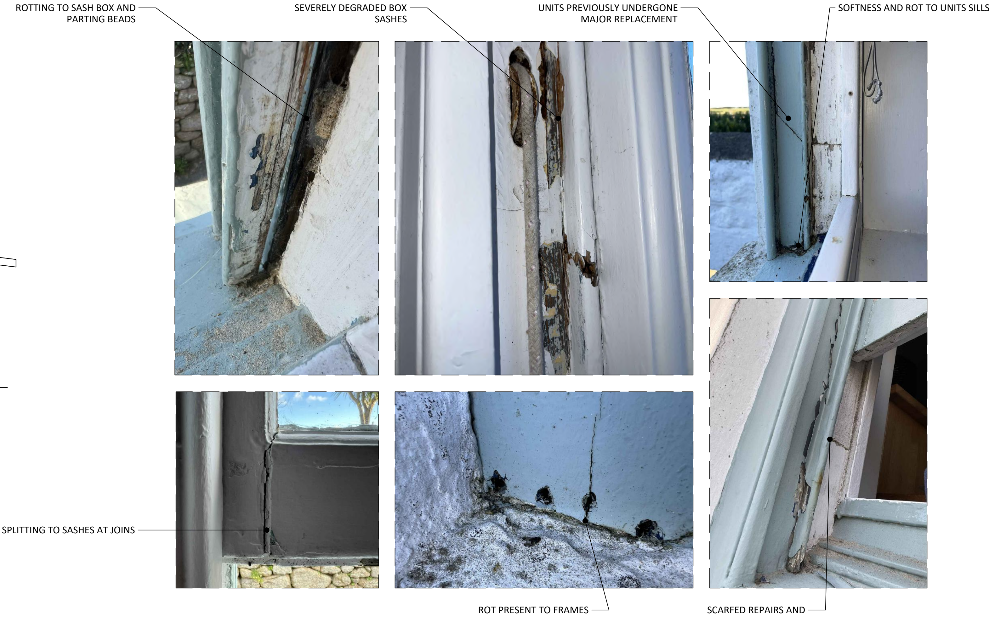
06 GROUP 1 TYPICAL DEFECTS REF 3528-1-500 SCALE N/A

© CAD ARCHITECTS LIMITED THE DESIGN AND LAYOUT IN THIS DRAWING ARE THE COPYRIGHT OF CAD ARCHITECTS LTD. AND MAY NOT BE AMENDED OR ADAPTED FOR ANY PURPOSE WITHOUT THE EXPRESS WRITTEN APPROVAL OF CAD ARCHITECTS LTD. THE DRAWING IS TO BE USED SOLELY FOR THE INTENDED PURPOSE AND THE ARCHITECT ACCEPTS NO RESPONSIBILITY FOR ANY ERRORS OR OMISSIONS ARISING THROUGH UNAUTHORISED USE. CONTRACTORS MUST CHECK ALL DIMENSIONS ON SITE AND ONLY WORK FROM FIGURED DIMENSIONS. TAKE SITE DIMENSIONS FOR ALL FABRICATION WORK. REFER ALL DISCREPANCIES AND REQUIREMENTS FOR ADDITIONAL INFORMATION TO THE ARCHITECT FOR CLARIFICATION OF INSTRUCTION BEFORE PUTTING WORK IN HAND.