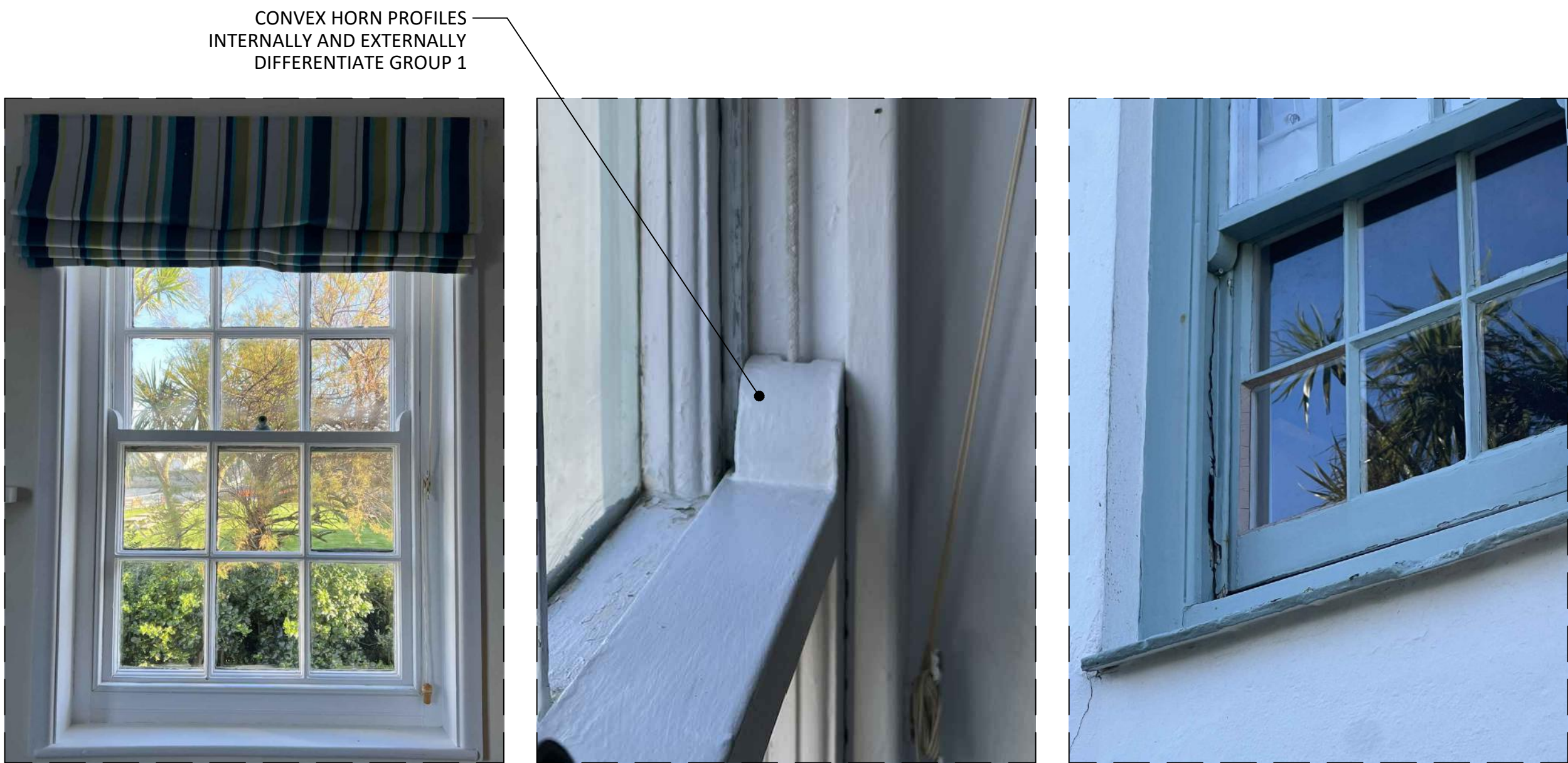
05 GROUP 1 TYPICAL PHOTOGRAPHS REF 3528-1-500 SCALE N/A

Group 1 timber sashes are characterised by their rounded profile of horns. With glazing bar profiles matching those of group 2's. All Convex Horned windows share matching profiles, though panel arrangements vary from 6 over 6, 4 over 4, and 2 over 2 units.