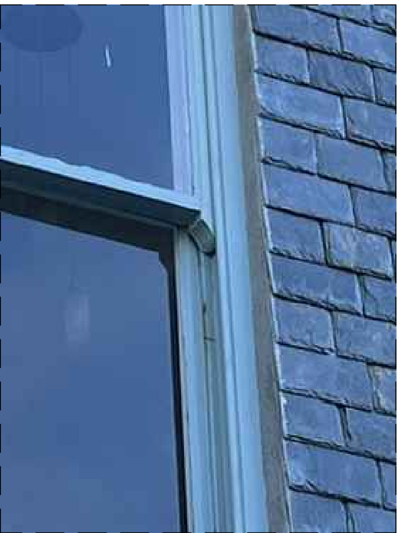
05 GROUP 3 TYPICAL PHOTOGRAPHS REF 3528-1-502 SCALE N/A

Group 3 timber sashes are characterised by their concave curving profile of single horn to their exterior, and vertical glazing bar profiles. All Concave Horned windows share matching profiles and are all arranged as 2 over 2 units.